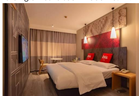
宜必思大酒店或同级 Ibis Wuxi HI Tech Hotel or similar 新区新光路 303 号 303 Xingguang Rd, Binhu