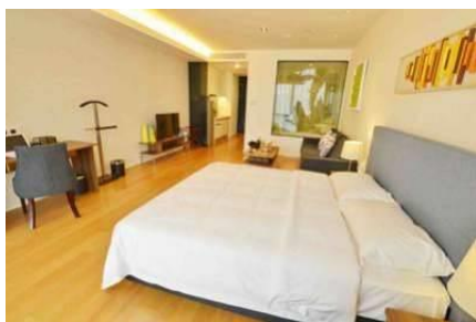
金澄大酒店或同级 Jin Cheng Grand Hotel or similar http://jinchengjinjianginternationalhotelsuzhou.ximantu.com/ 相城区, 兴太路 260 号 Xiangcheng Qu, Xingtai Rd, 260