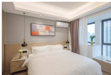
金沙博乐诗酒店或同级 Berkesy Jinsha Hotel or similar 下沙南路 429 号中豪七格 5 幢, 下沙区 Building 5 Xiasha south Road No. 429