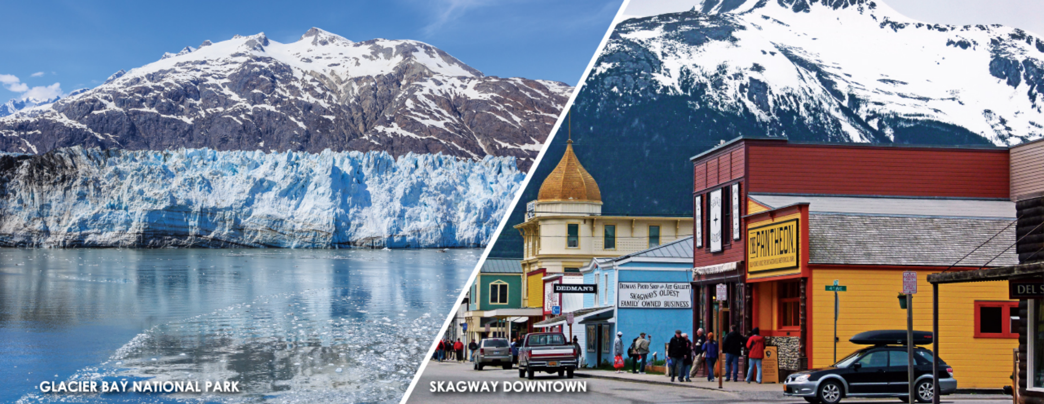
GLACIER BAY NATIONAL PARK