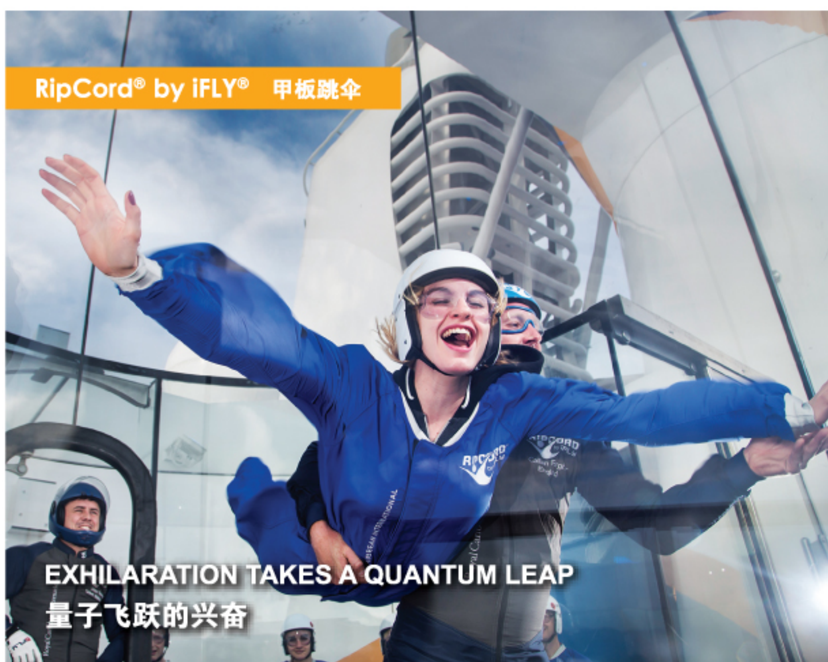
RipCord® by iFLY® 甲板跳伞

EXHILARATION TAKES A QUANTUM LEAP 量子飞跃的兴奋