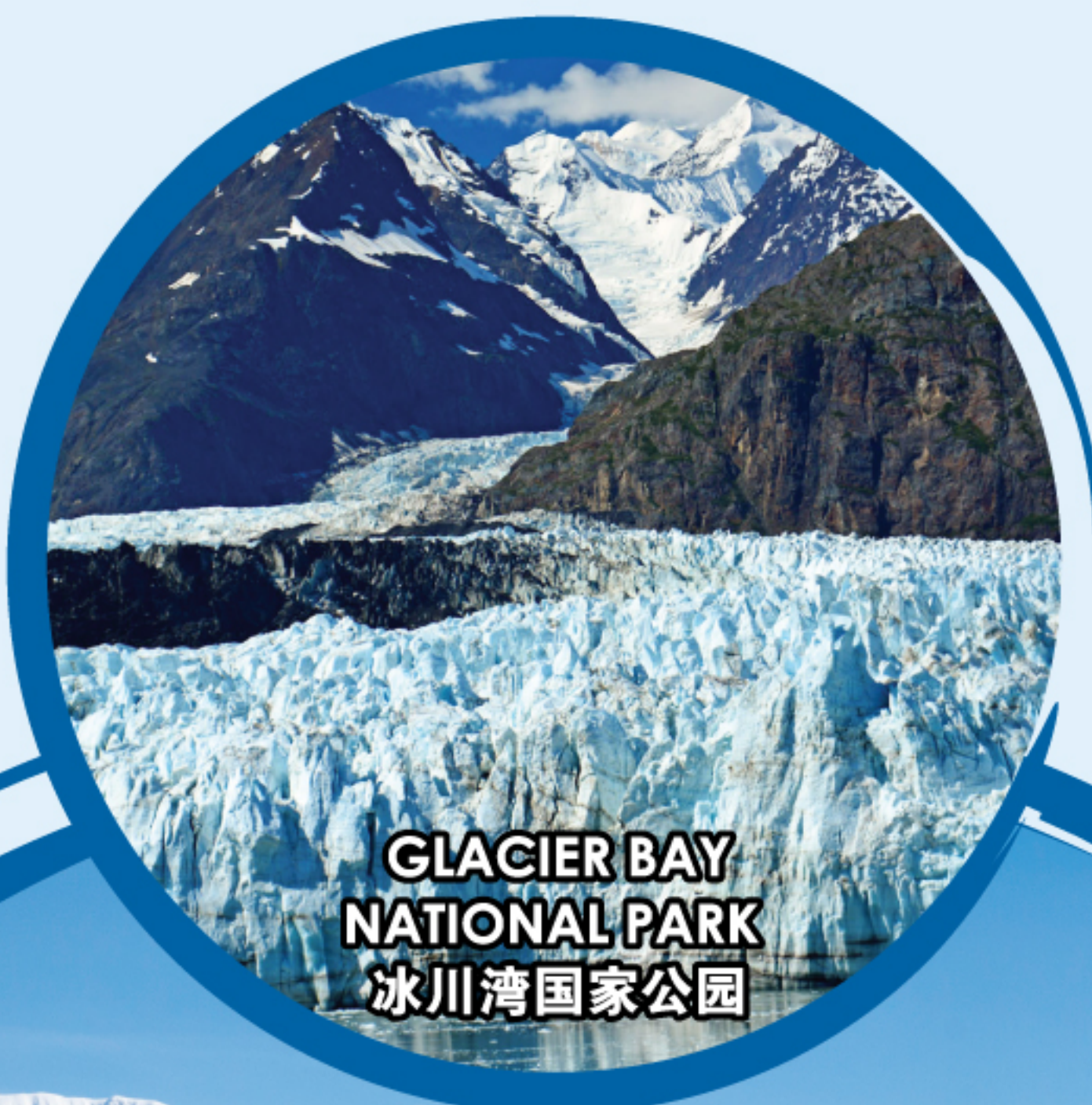
GLACIER BAY NATIONAL PARK 冰川湾国家公园