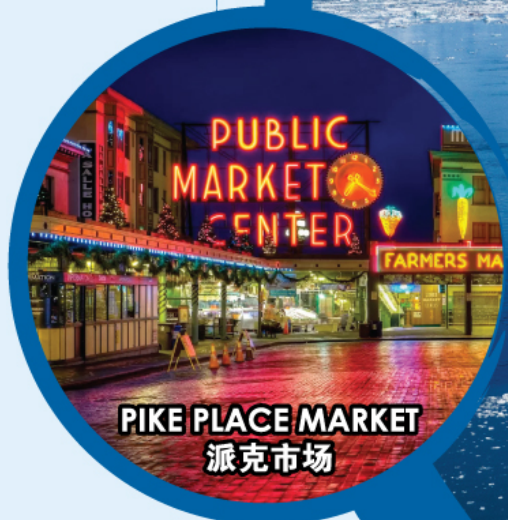
PIKE PLACE MARKET 派克市场