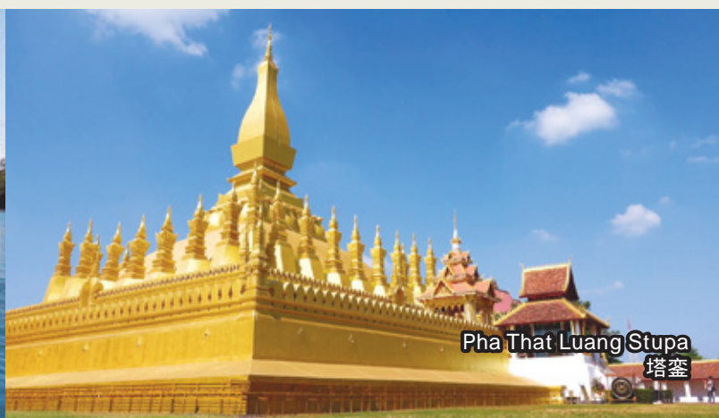
Pha That Luang Stupa 塔塞