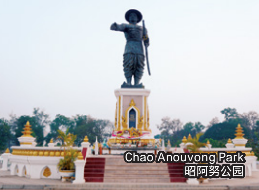
Chao Anouvong Park 昭阿努公园