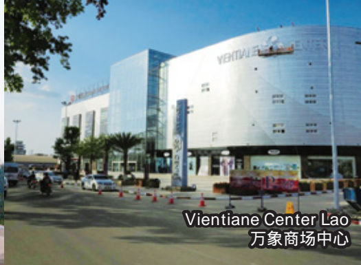
Vientiane Center Lao 万象商场中心