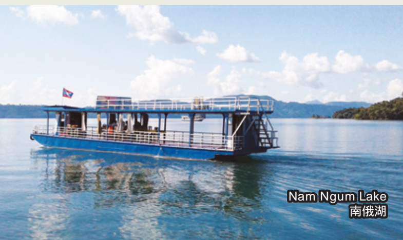
Nam Ngum Lake 南俄湖

**Due For Vang Vieng Not Allowed Bus Entry , Only Tuk Tuk Available During Vang Vieng Tour