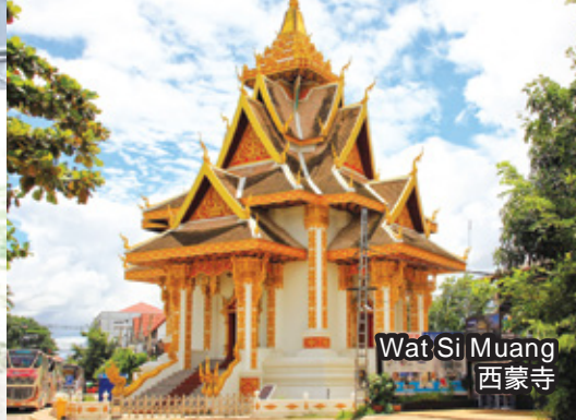
Wat Si Muang 西蒙寺