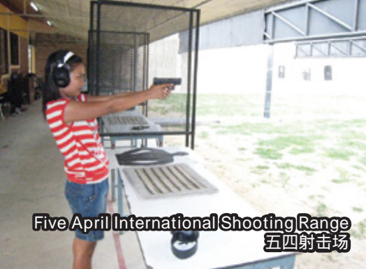
Five April International Shooting Range 五四射击场