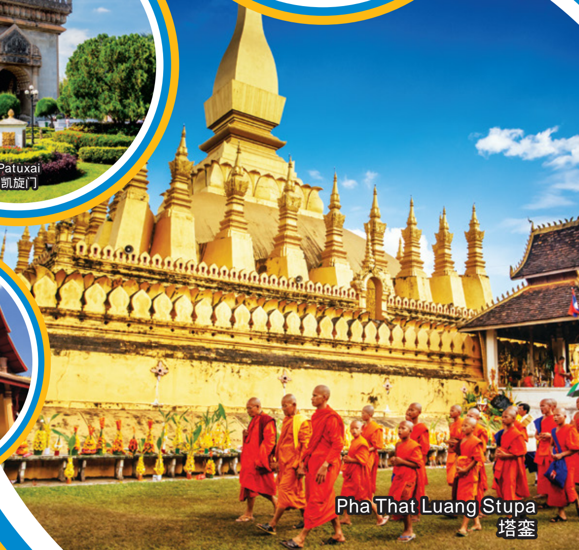
Pha That Luang Stupa 塔銮

行程次序，以当地旅社安排为准。 Sequences of Itinerary are subject to local arrangement.