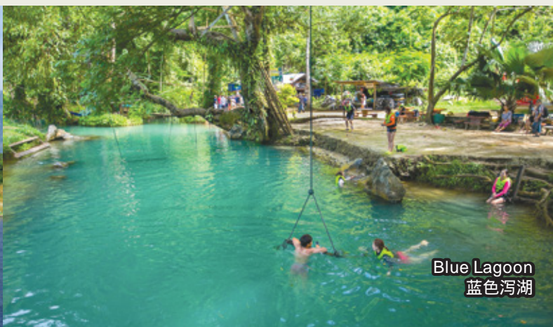
Blue Lagoon 蓝色泻湖