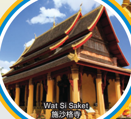
Wat Si Saket 施沙格寺