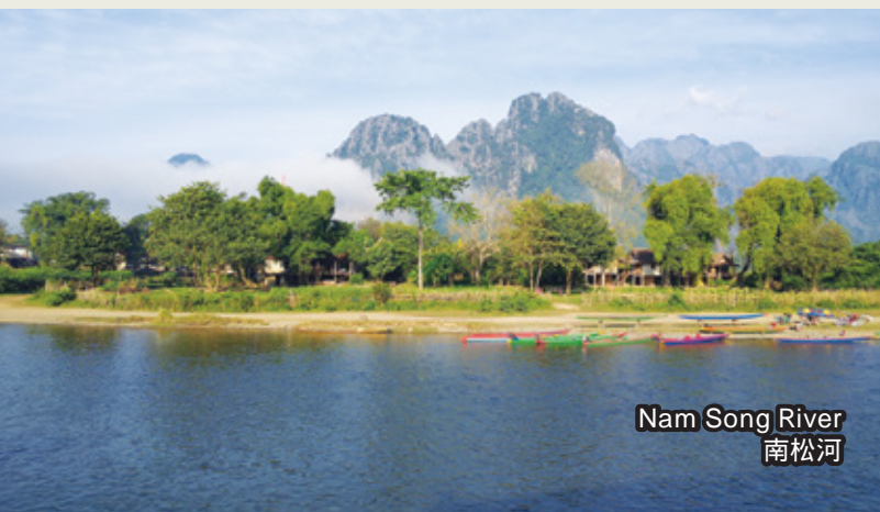
Nam Song River 南松河