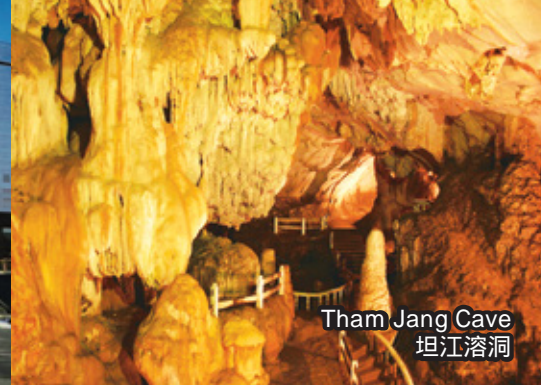
Tham Jang Cave 坦江溶洞