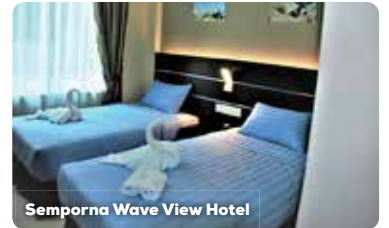
Semporna Wave View Hotel