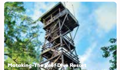
Matakning-The Reef Dive Resort