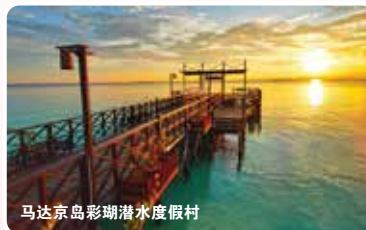
马达京岛彩瑚潜水度假村