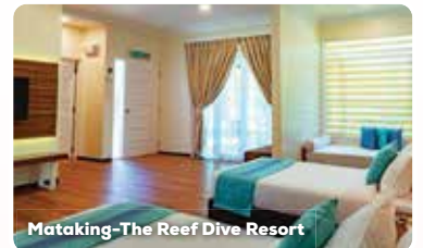
Matakning-The Reef Dive Resort