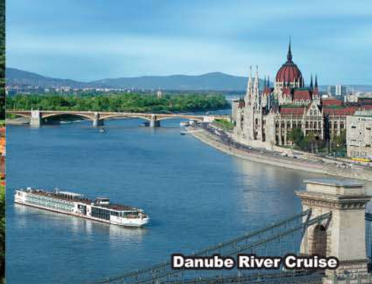
Danube River Cruise