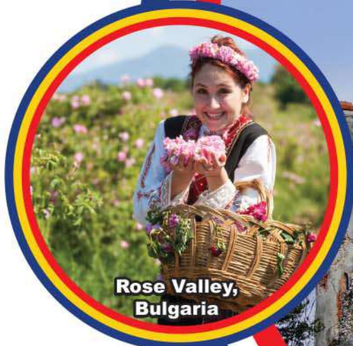
Rose Valley, Bulgaria