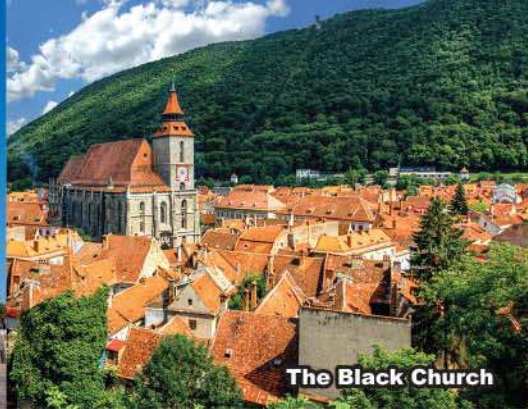
The Black Church