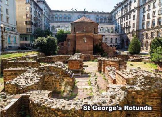
St George's Rotunda