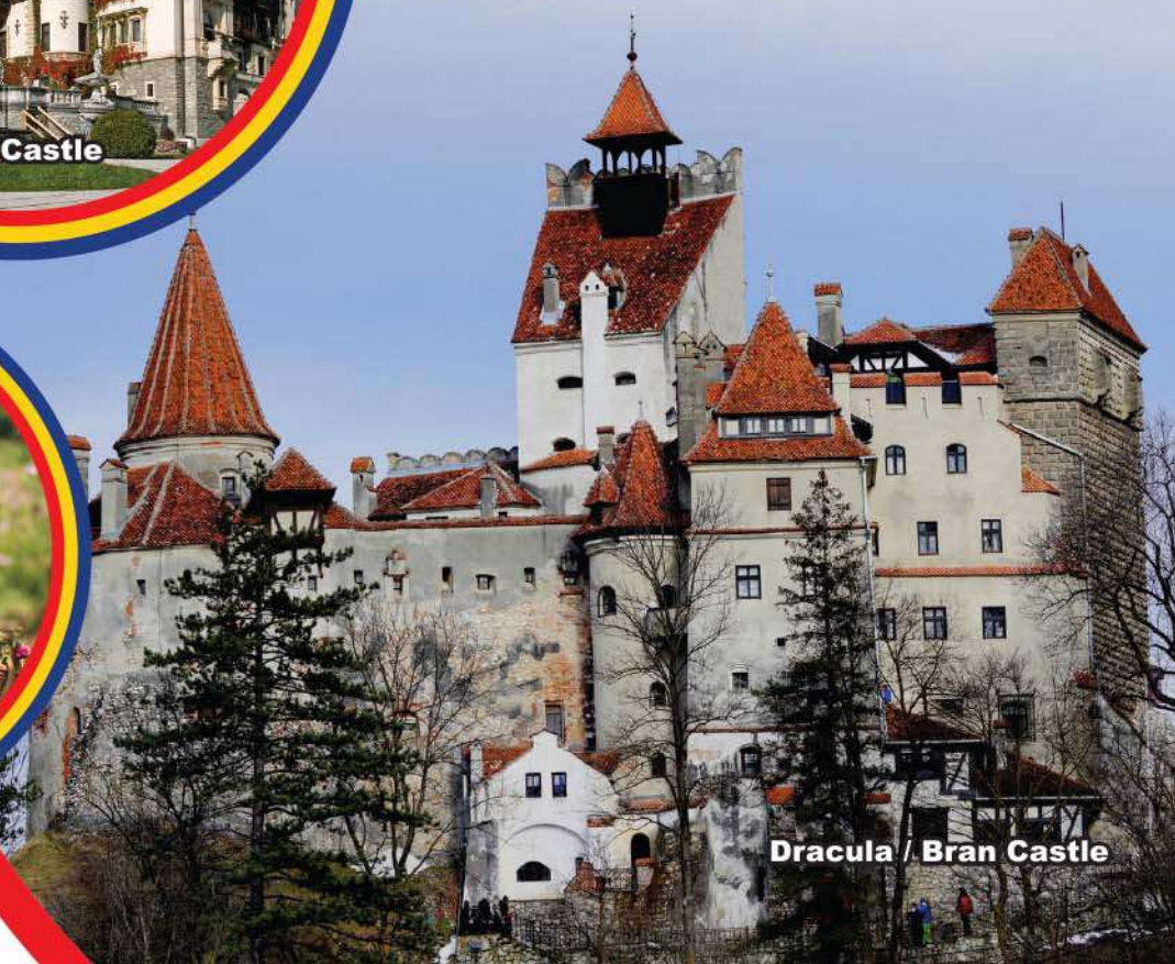
Dracula / Bran Castle