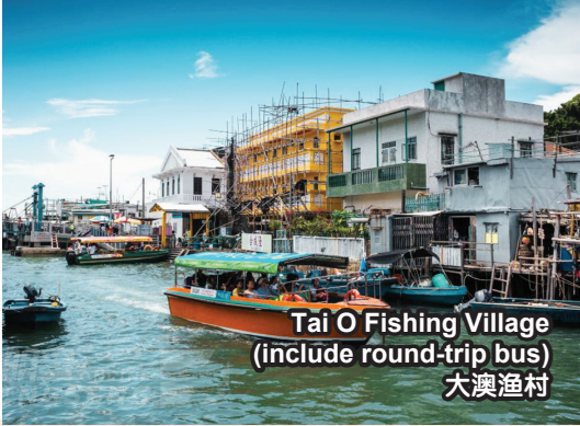
Tai O Fishing Village (include round-trip bus) 大澳渔村