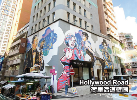
Hollywood Road 荷里活道壁画