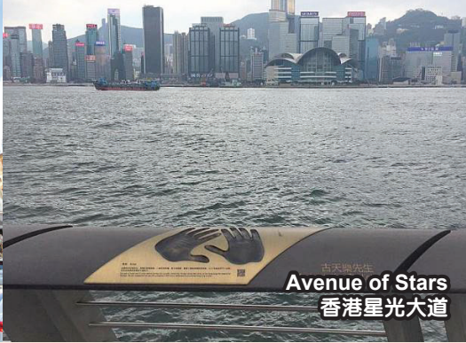
Avenue of Stars 香港星光大道