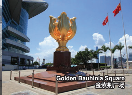
Golden Bauhinia Square 金紫荆广场