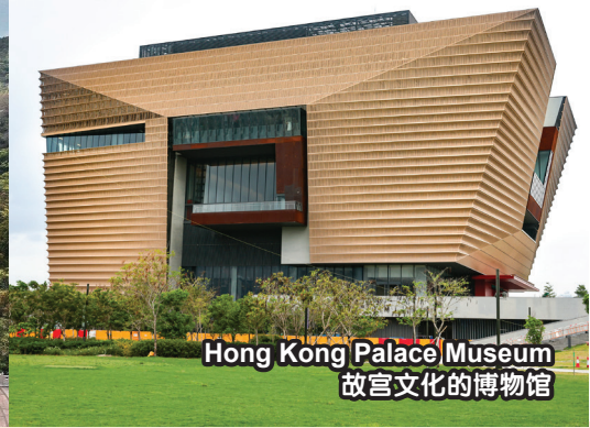
Hong Kong Palace Museum 故宫文化的博物馆