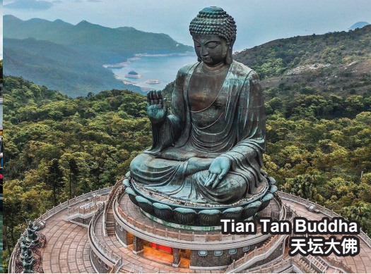
Tian Tan Buddha 天坛大佛