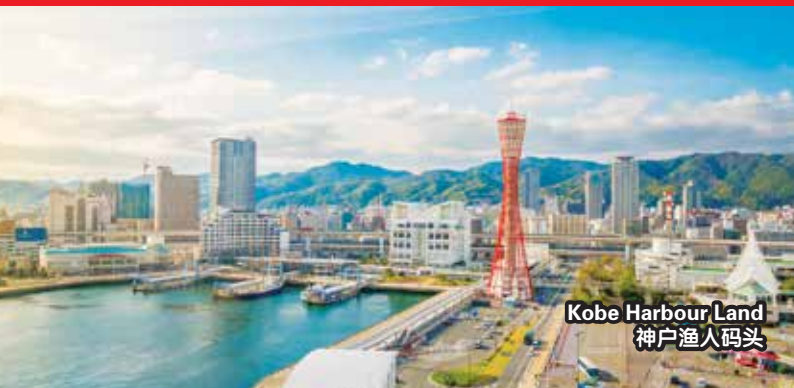
Kobe Harbour Land 神户渔人码头

自费行程: 美山町合掌村、锦市场、心斋桥、道顿堀。JPY 10,000/人 【价格以参加人数为准; 小孩价格与成人同价 (除婴儿外, 手抱婴儿不占座位不收费)】