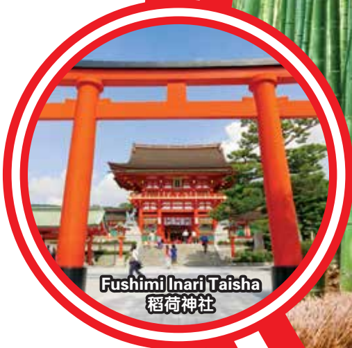
Fushimi Inari Taisha 稻荷神社