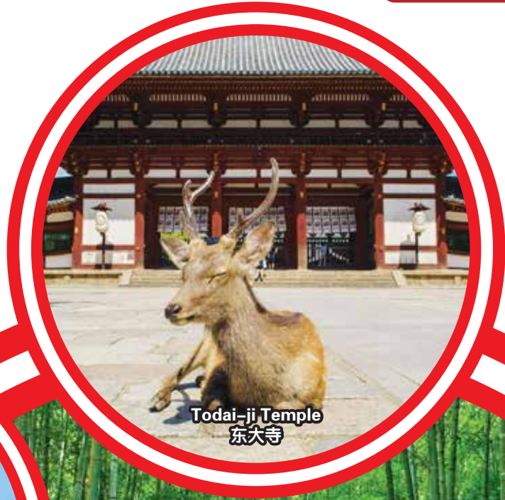
Todai-ji Temple 东大寺