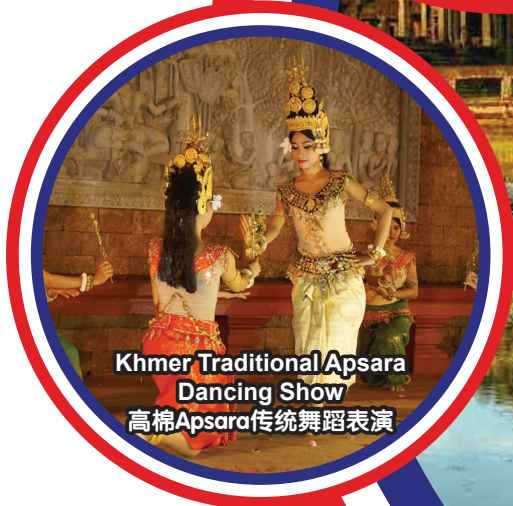
Khmer Traditional Apsara Dancing Show 高棉Apsara传统舞蹈表演