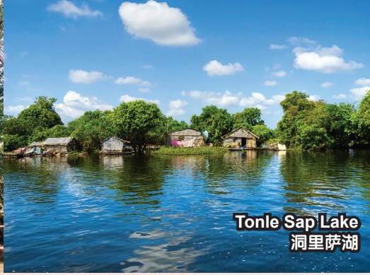
Tonle Sap Lake 洞里萨湖