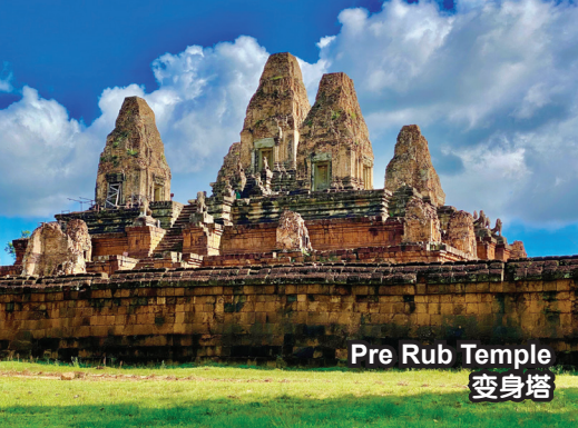
Pre Rup Temple 变身塔