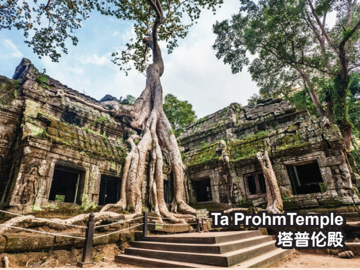
Ta Prohm Temple 塔普伦殿