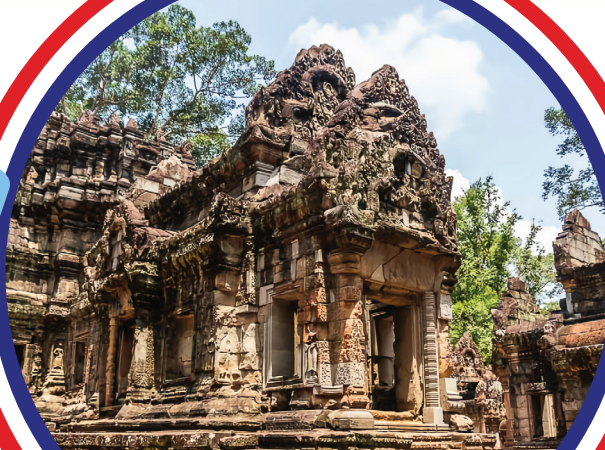
Chau Say Tevoda 周萨神殿

FREE 免费 • 一小时全身按摩 · 1 Hour Body Massage 或or • 一小时足部按摩 · 1 Hour Foot Massage