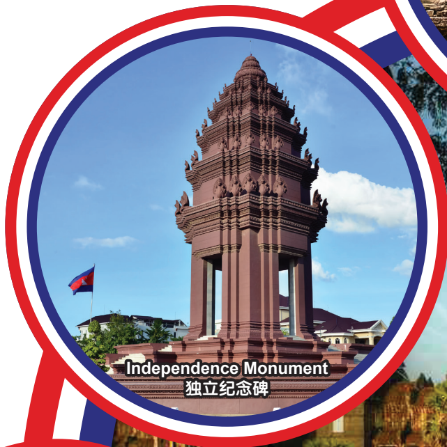
Independence Monument 独立纪念碑