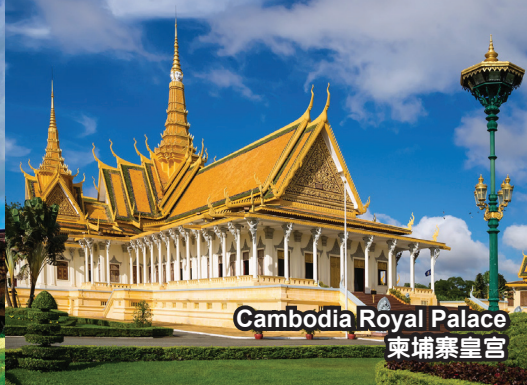
Cambodia Royal Palace 柬埔寨皇宫