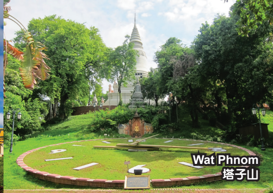
Wat Phnom 塔子山