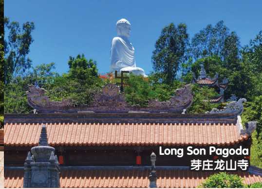
Long Son Pagoda 芽庄龙山寺