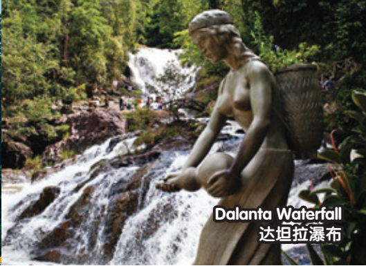
Dalanta Waterfall 达坦拉瀑布