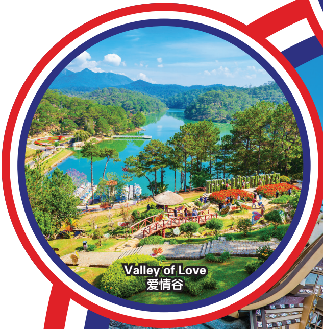
Valley of Love 爱情谷