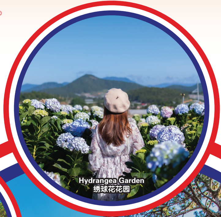
Hydrangea Garden 绣球花花园