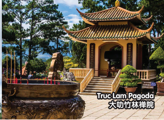
Truc Lam Pagoda 大叻竹林禅院