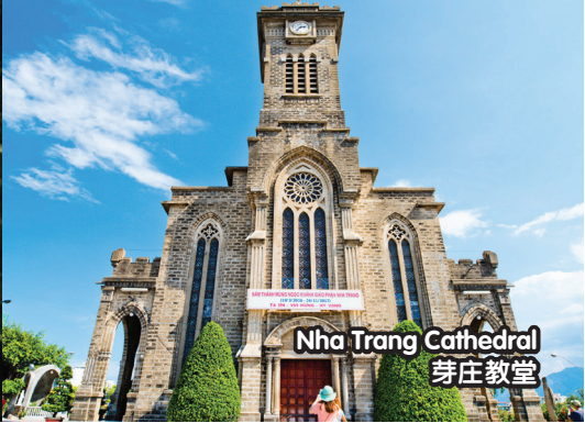
Nha Trang Cathedral 芽庄教堂