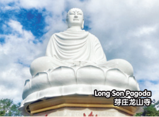
Long Son Pagoda 芽庄龙山寺