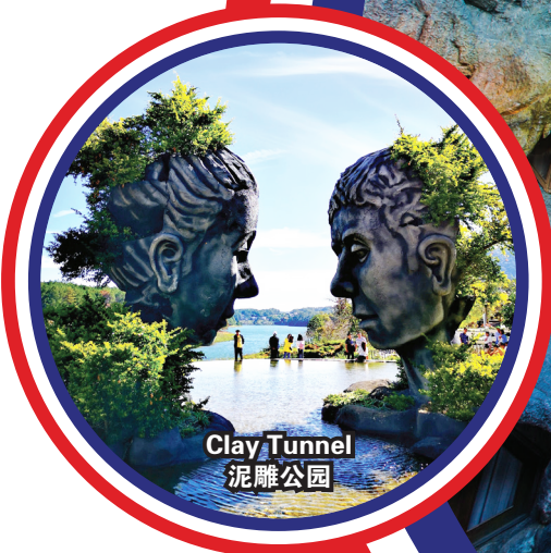
Clay Tunnel 泥雕公园