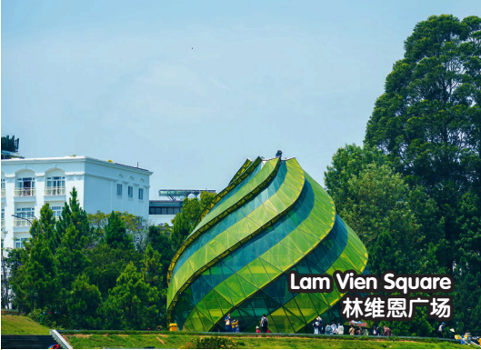
Lam Vien Square 林维恩广场