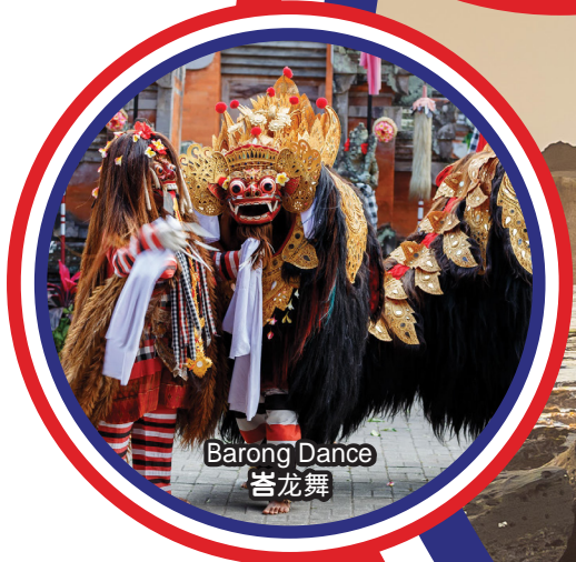
Barong Dance 峇龙舞

行程次序，以当地旅社安排为准。 Sequences of Itinerary are subject to local arrangement.