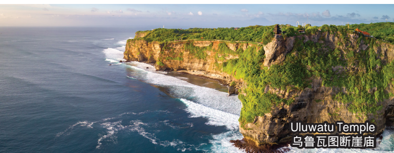
Uluwatu Temple 乌鲁瓦图断崖庙