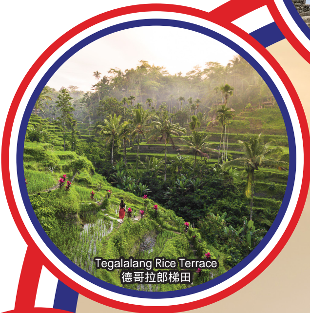
Tegallalang Rice Terrace 德哥拉郎梯田