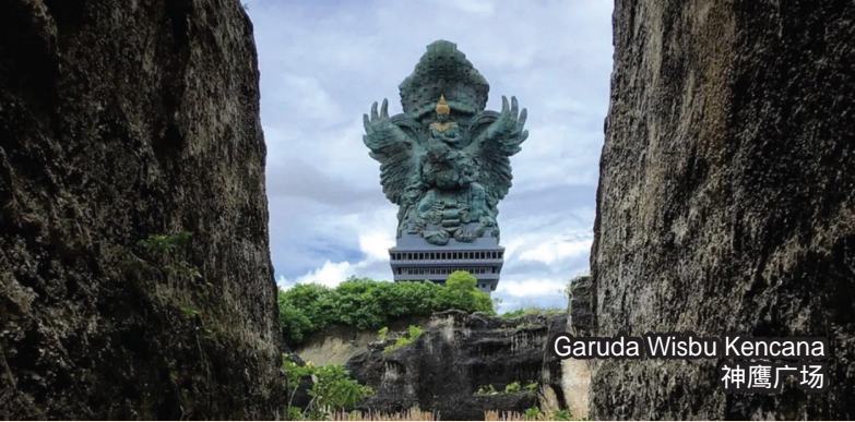
Garuda Wisbu Kencana 神鷹广场