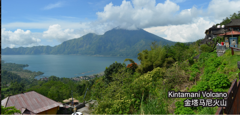
Kintamani Volcano 金塔马尼火山