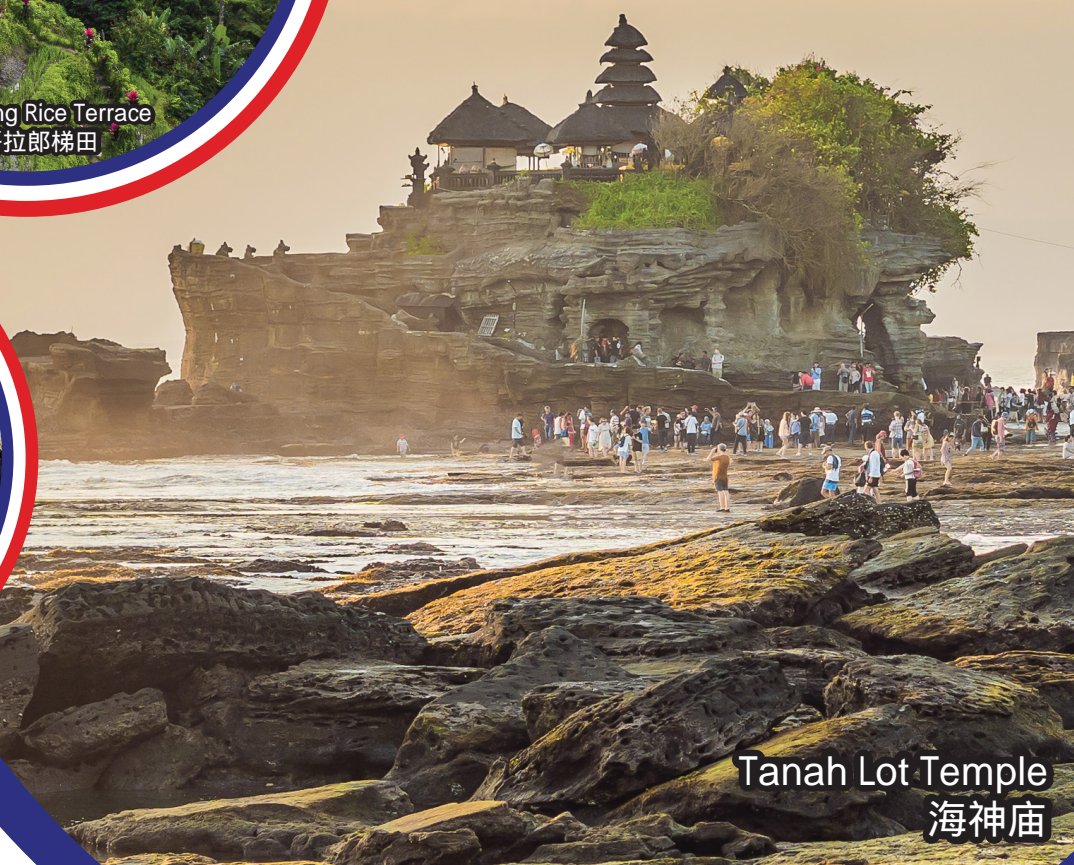
Tanah Lot Temple 海神庙

行程次序，以当地旅社安排为准。 Sequences of Itinerary are subject to local arrangement.