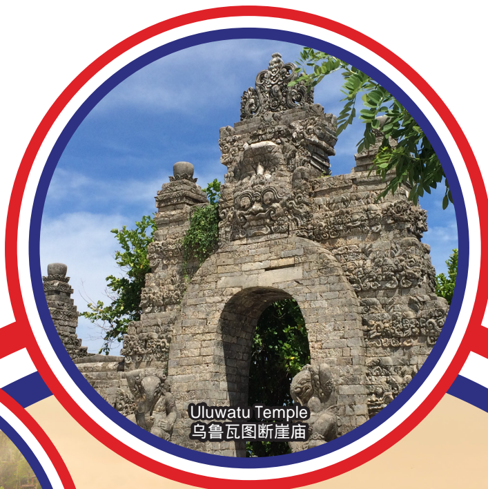
Uluwatu Temple 乌鲁瓦图断崖庙