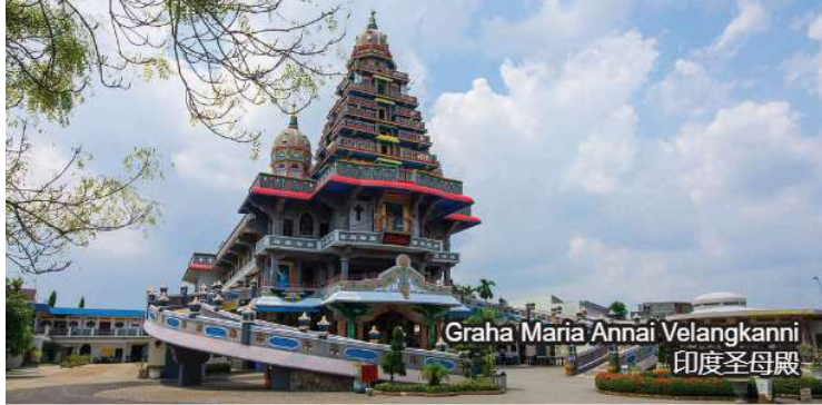
Graha Maria Annai Velangkanni 印度圣母殿