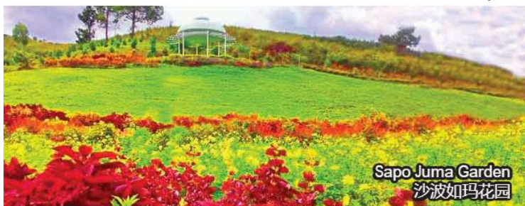
Sapo Juma Garden 沙波如玛花园