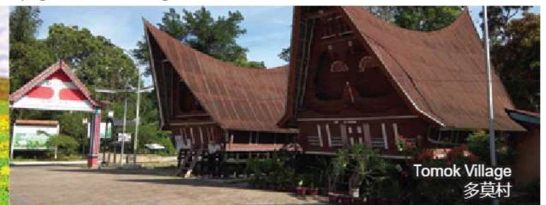
Tomok Village 多莫村

Disclaimer: Due to Covid-19 travel restrictions, local / religious festivals, public holidays, weather condition, transport technical issue, acts of nature, Golden Destinations reserved the right to alter the sequence or change, amend or alter the itinerary if necessary, with or without prior notice.