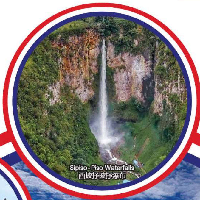
Sipiso-Piso Waterfalls 西坡抒坡抒瀑布