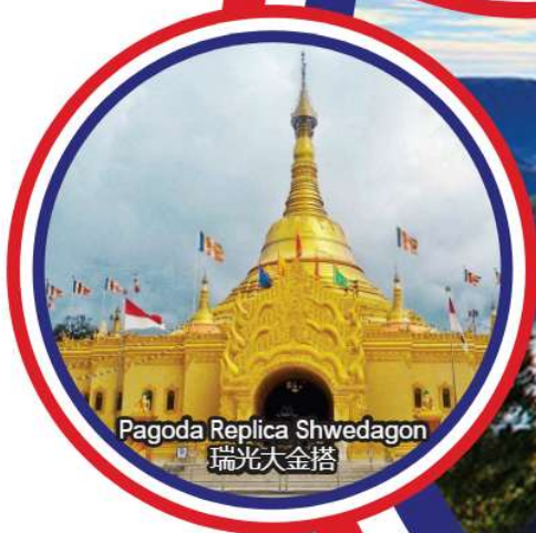
Pagoda Replica Shwedagon 瑞光大金塔

行程次序，以当地旅社安排为准。 Sequences of Itinerary are subject to local arrangement.