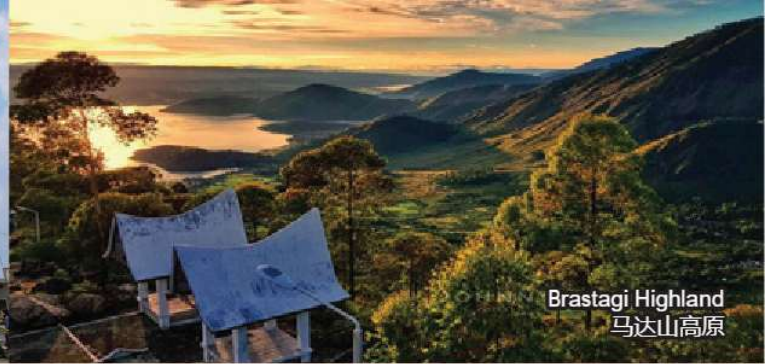
Brastagi Highland 马达山高原