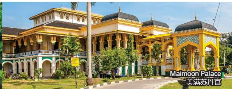
Maimoon Palace 美满苏丹宫

免责声明: 由于新冠肺炎疫情旅行限制当地/宗教节日, 公众假期, 天气状况, 交通等情况, 自然灾害, 必要时黄金旅程保留对行程进行适当调整 (调整景点游览顺序) 以确保行程顺利进行, 会或事先通知。 备注: 如果旅游行程受到上述问题的影响, 将不予退款或更换。图片仅供参考。