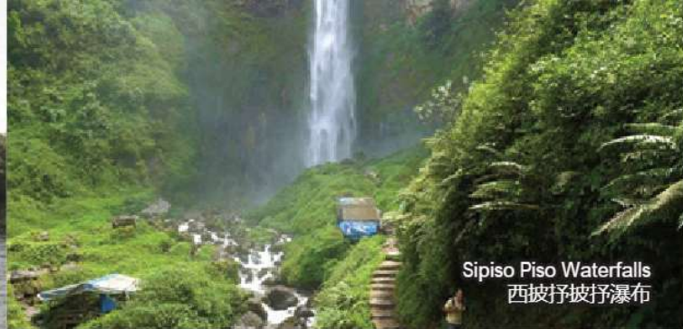
Sipiso Piso Waterfalls 西坡抒披抒瀑布