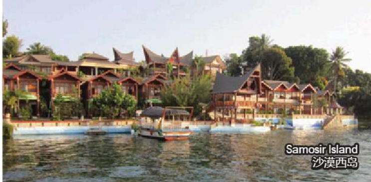
Samosir Island 沙漠西岛