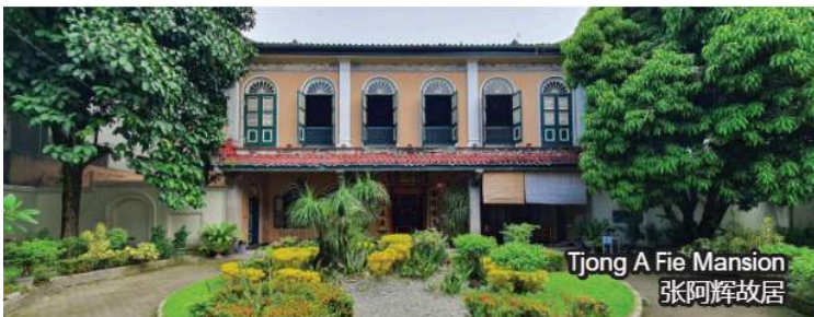
Tjong A Fie Mansion 张阿辉故居