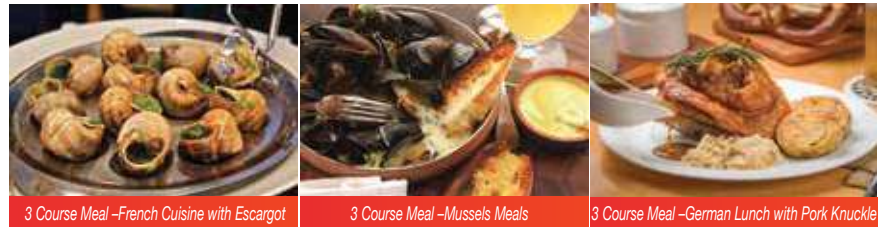
3 Course Meal - French Cuisine with Escargot