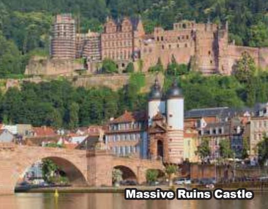
Massive Ruins Castle