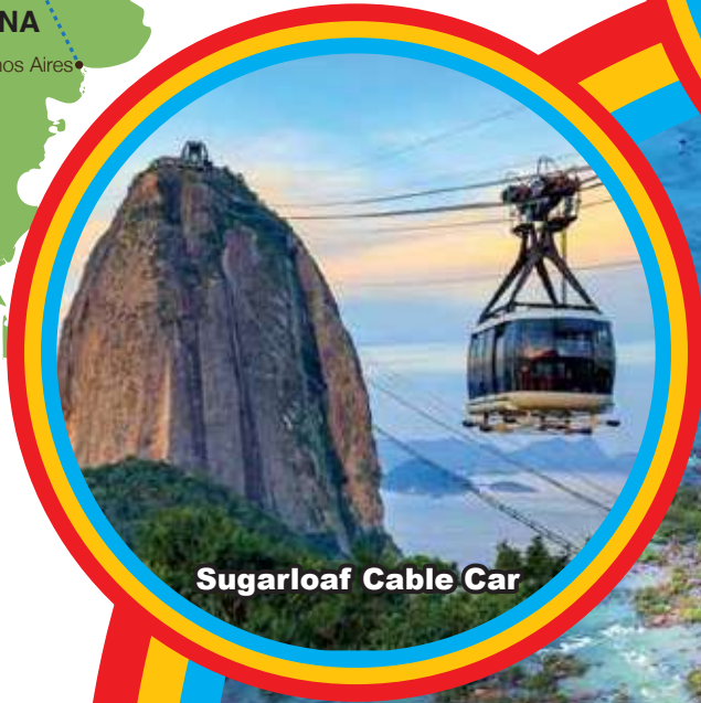
Sugarloaf Cable Car