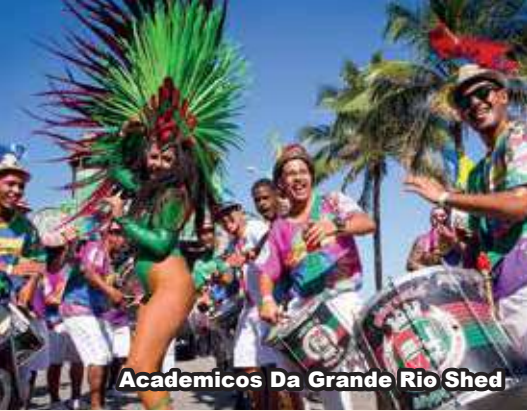
Academicos Da Grande Rio Shed