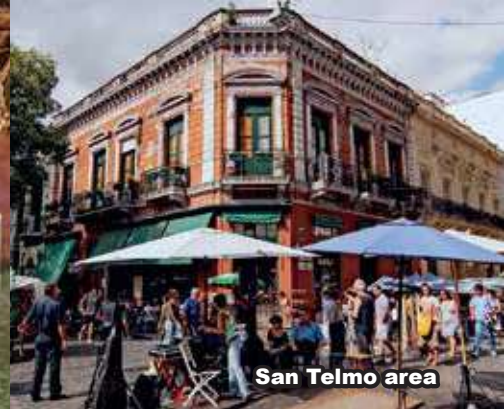
San Telmo area