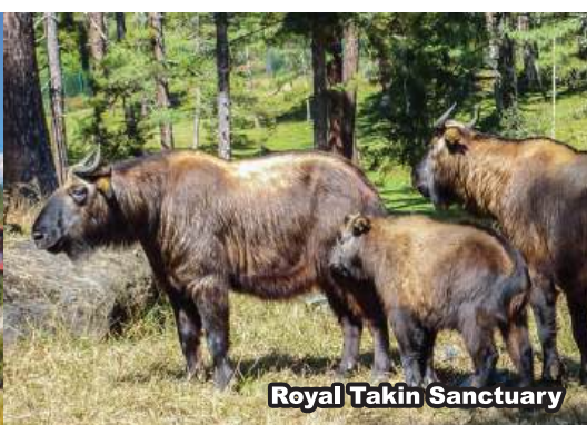
Royal Takin Sanctuary