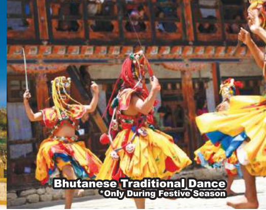
Bhutanese Traditional Dance *Only During Festive Season