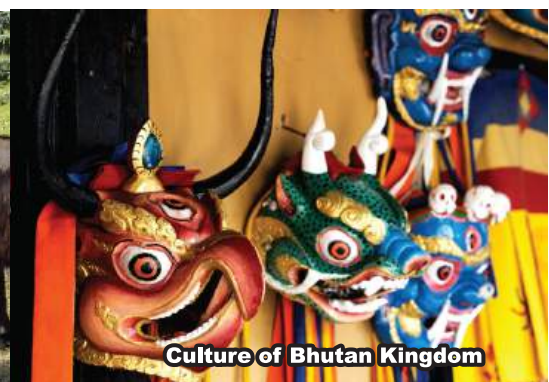
Culture of Bhutan Kingdom