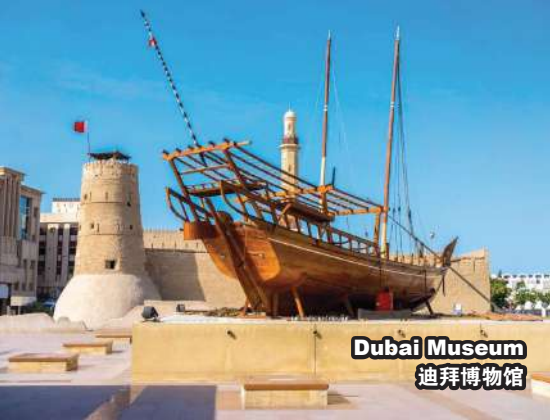
Dubai Museum 迪拜博物馆