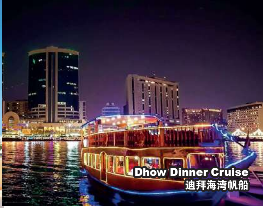
Dhow Dinner Cruise 迪拜海湾帆船