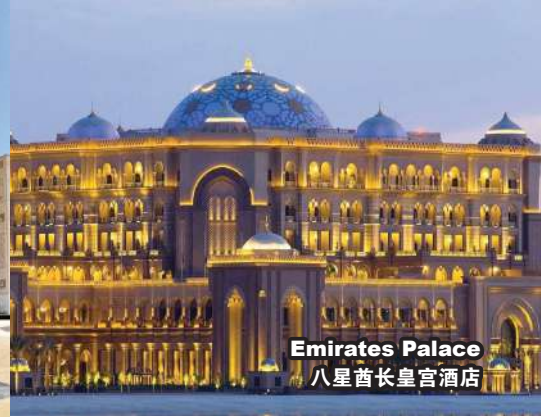
Emirates Palace 八星酋长皇宫酒店