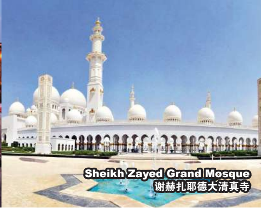
Sheikh Zayed Grand Mosque 谢赫扎耶德大清真寺