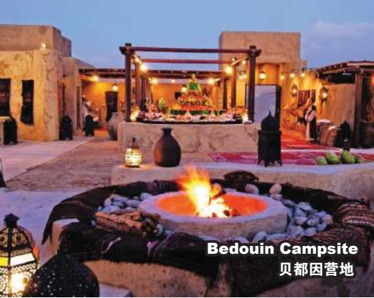
Bedouin Campsite 贝都因营地