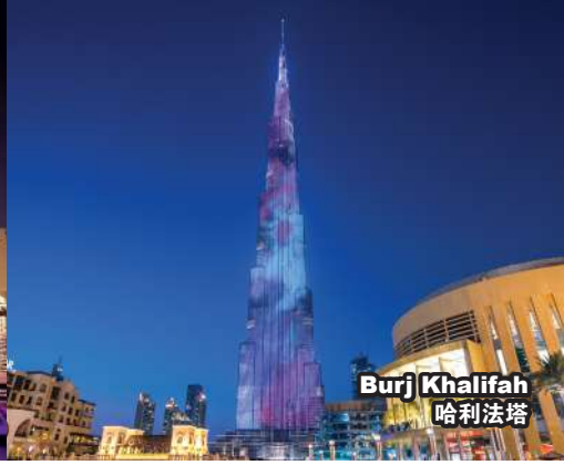
Burj Khalifah 哈利法塔