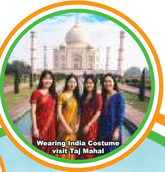
Wearing India Costume visit Taj Mahal