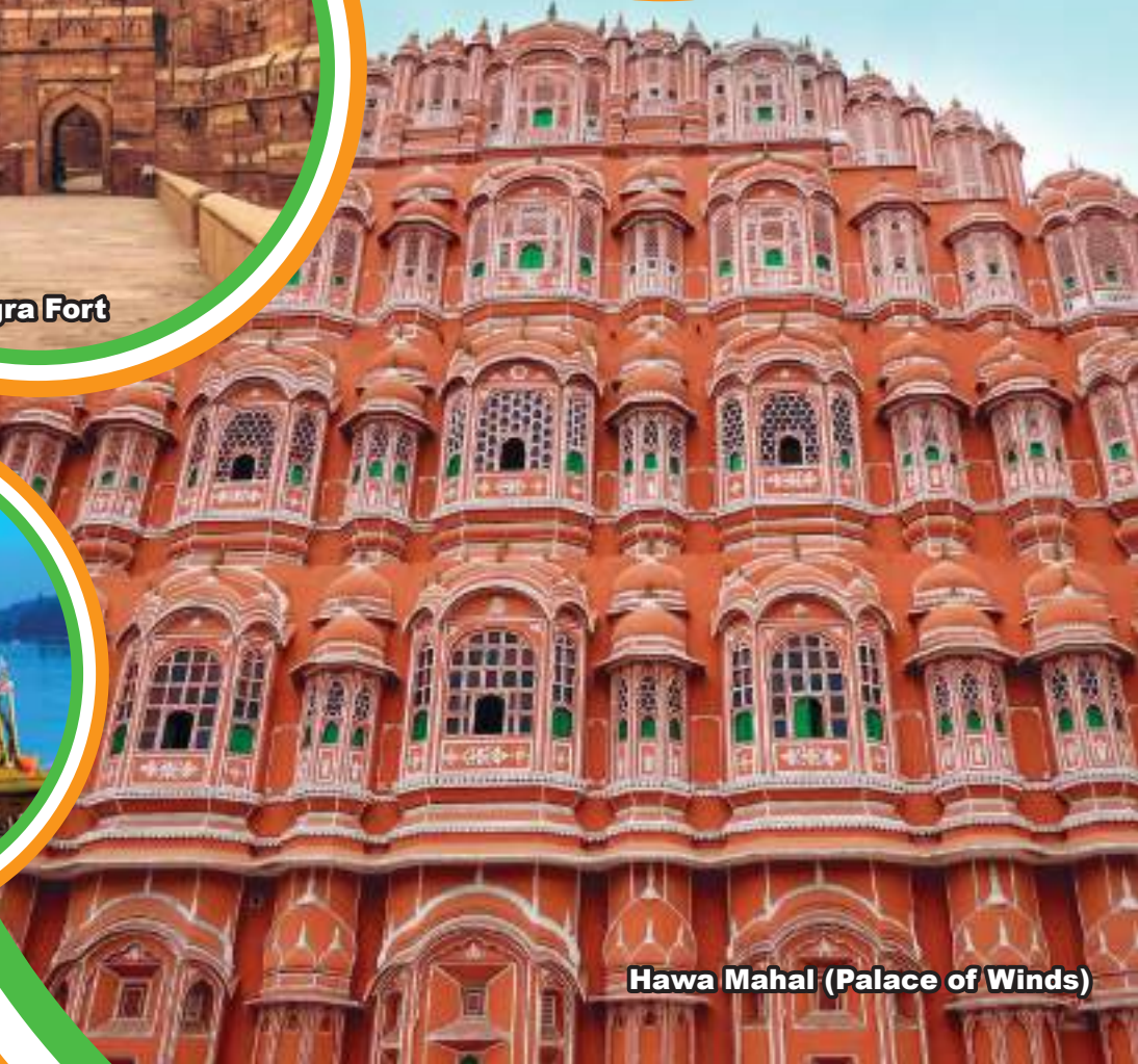
Hawa Mahal (Palace of Winds)