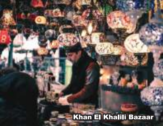
Khan El Khalili Bazaar