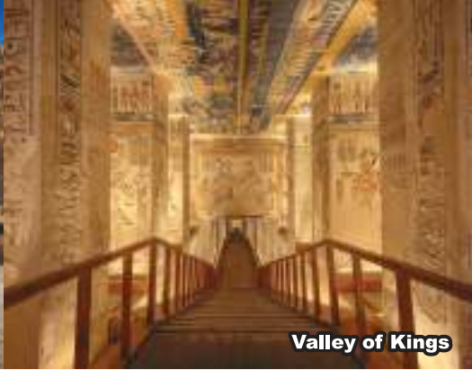
Valley of Kings