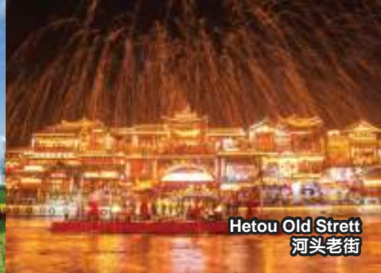
Hetou Old Street 河头老街