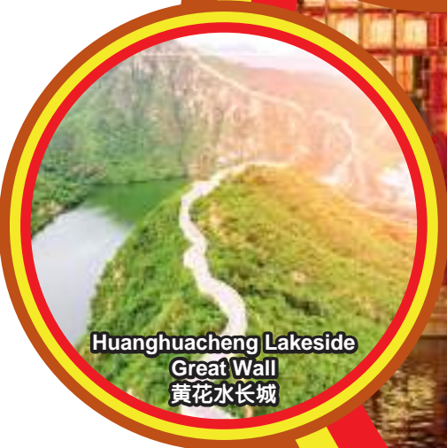
Huanghuacheng Lakeside Great Wall 黄花水长城