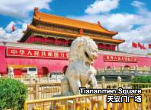
Tiananmen Square 天安门广场