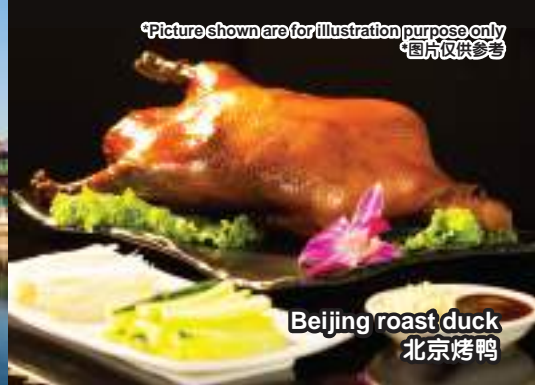
Beijing roast duck 北京烤鸭