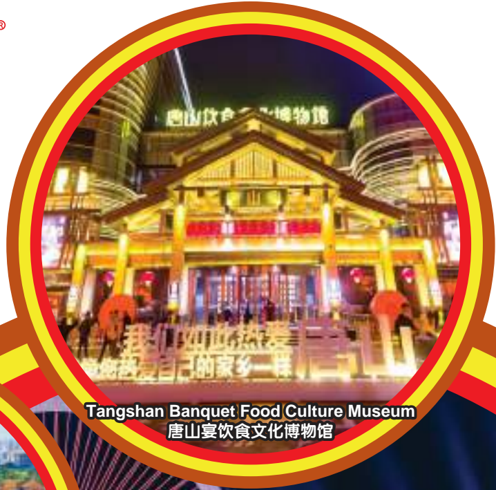
Tangshan Banquet Food Culture Museum 唐山宴饮食文化博物馆