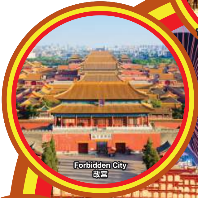
Forbidden City 故宫