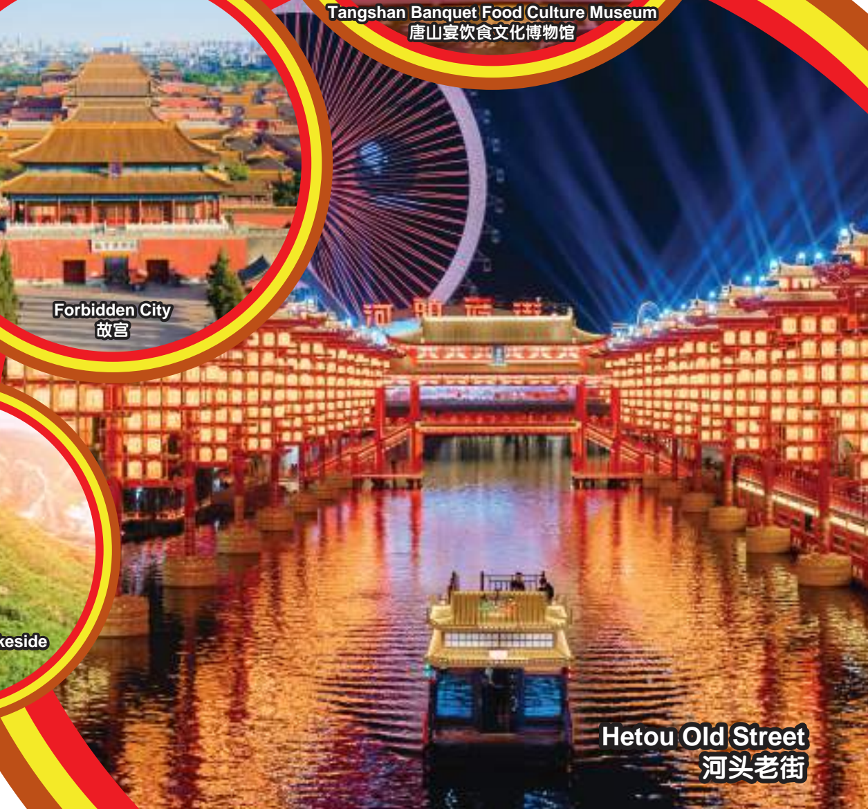
Hetou Old Street 河头老街

行程次序·以当地旅社安排为准。 Sequences of Itinerary are subject to local arrangement.