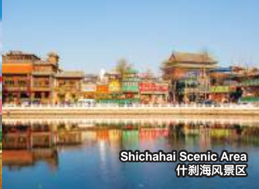
Shichahai Scenic Area 什刹海风景区