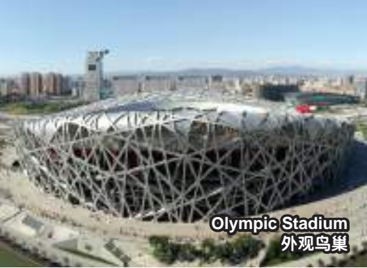
Olympic Stadium 外观鸟巢