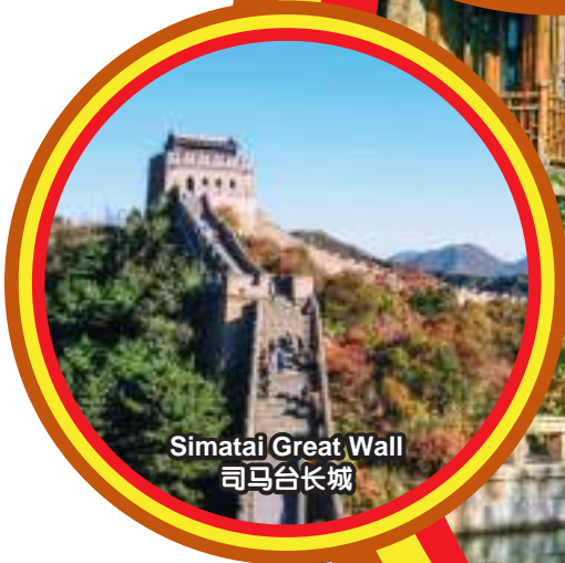
Simatai Great Wall 司马台长城

行程次序，以当地旅社安排为准。 Sequences of Itinerary are subject to local arrangement.