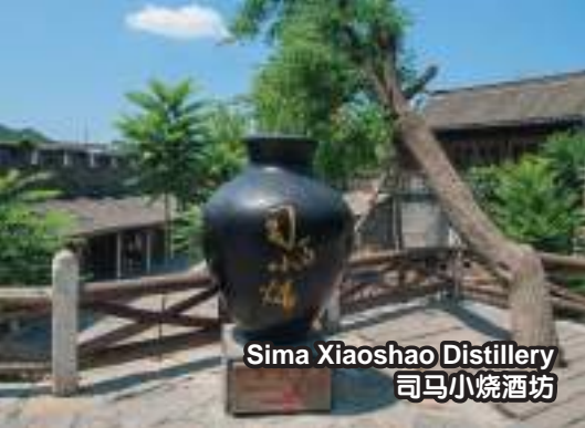
Sima Xiaoshao Distillery 司马小烧酒坊