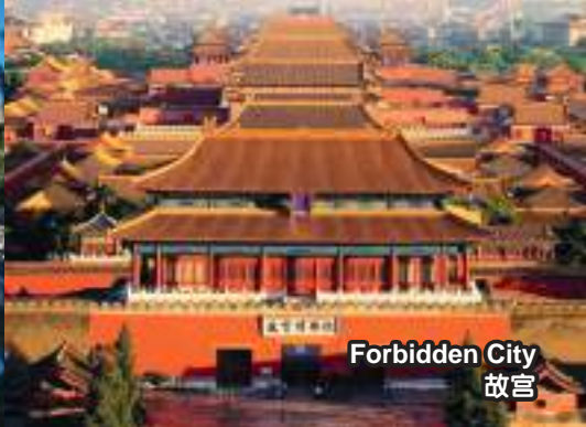
Forbidden City 故宫