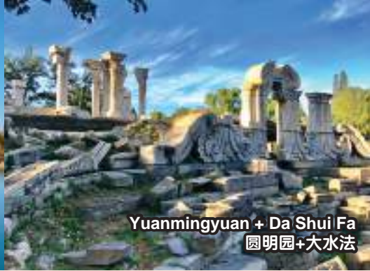
Yuanmingyuan + Da Shui Fa 圆明园+大水法