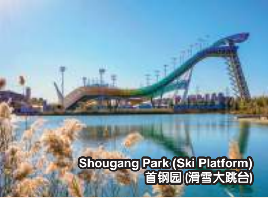
Shougang Park (Ski Platform) 首钢园 (滑雪大跳台)