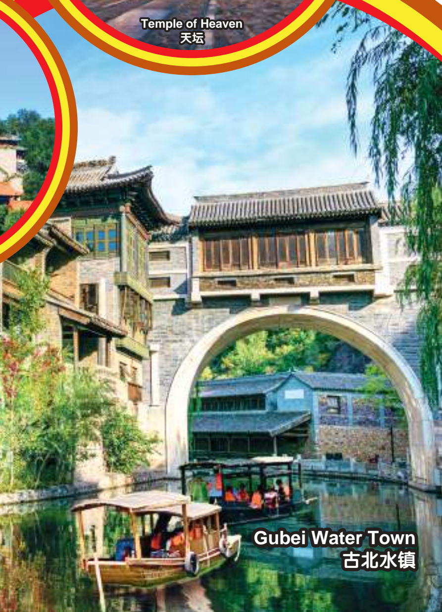
Gubei Water Town 古北水镇

行程次序，以当地旅社安排为准。 Sequences of Itinerary are subject to local arrangement.