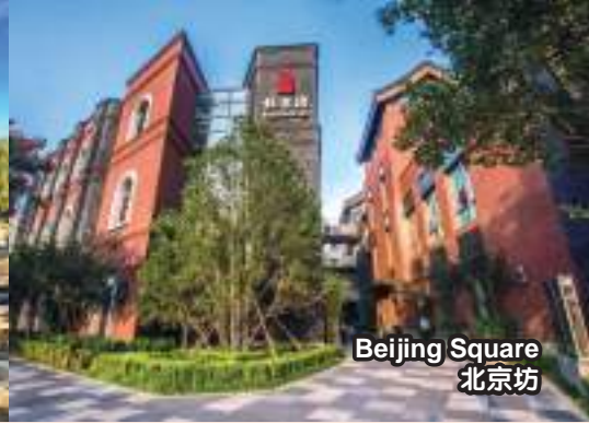
Beijing Square 北京坊