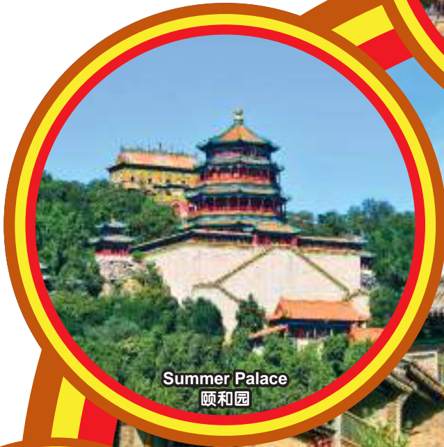
Summer Palace 颐和园