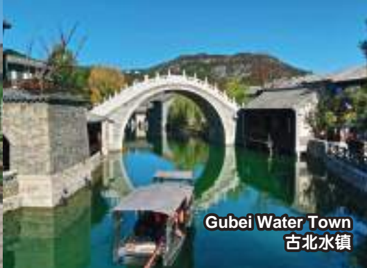
Gubei Water Town 古北水镇