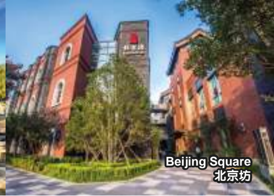
Beijing Square 北京坊