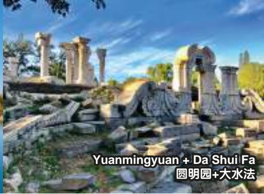
Yuanmingyuan + Da Shui Fa 圆明园+大水法