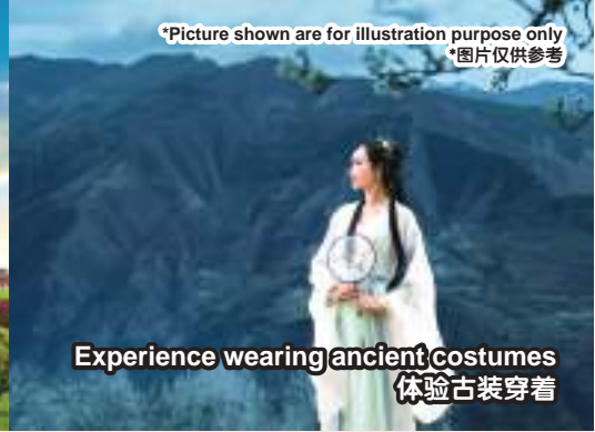
Experience wearing ancient costumes 体验古装穿着