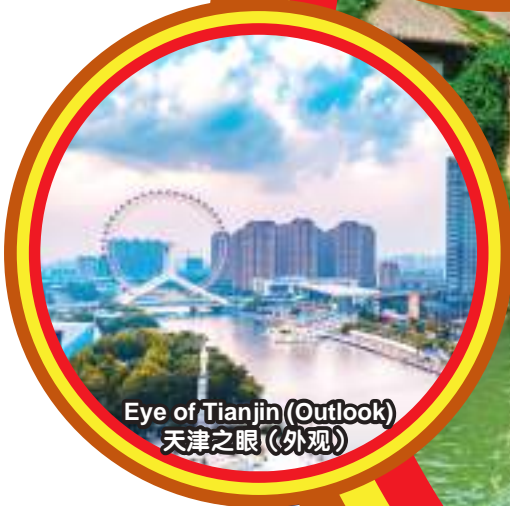
Eye of Tianjin (Outlook) 天津之眼 (外观)