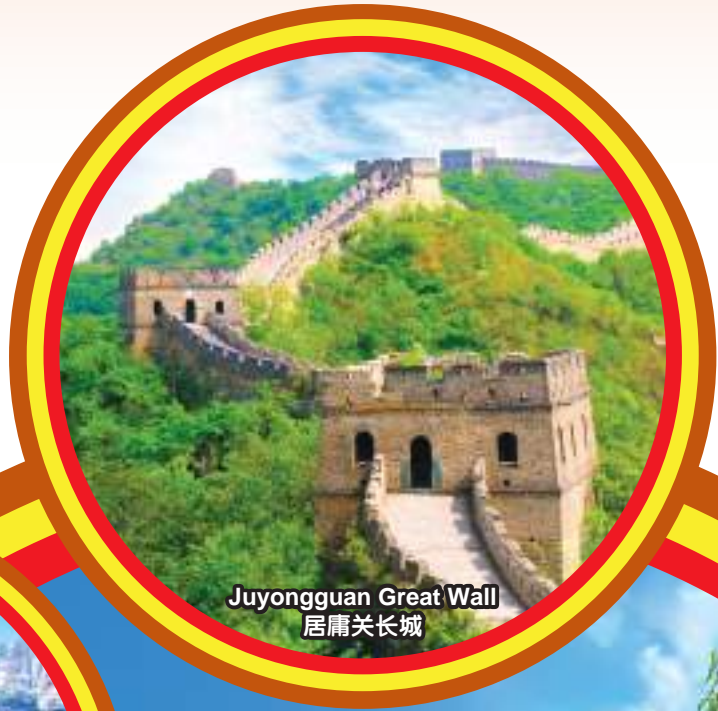
Juyongguan Great Wall 居庸关长城