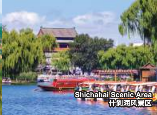
Shichahai Scenic Area 什刹海风景区