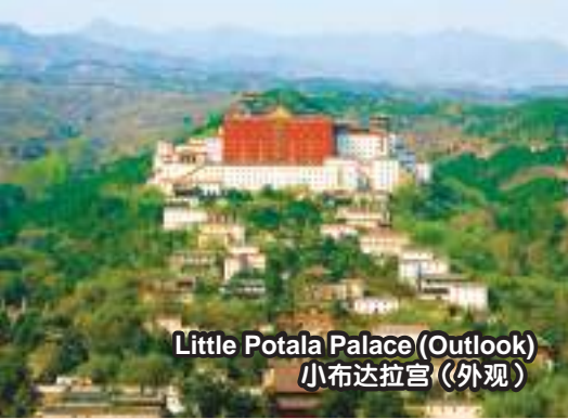
Little Potala Palace (Outlook) 小布达拉宫 (外观)