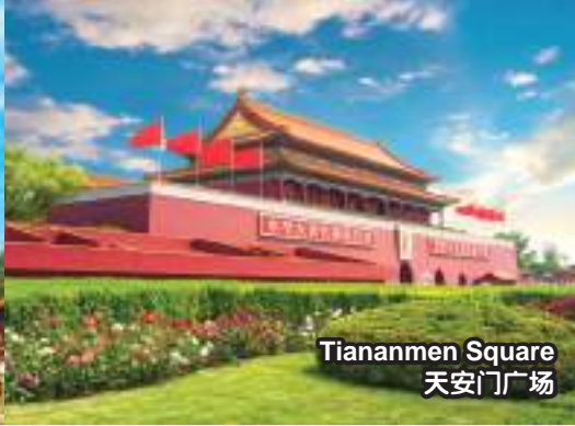
Tiananmen Square 天安门广场