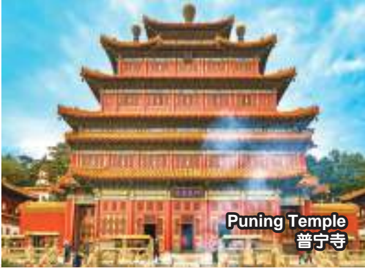
Puning Temple 普宁寺