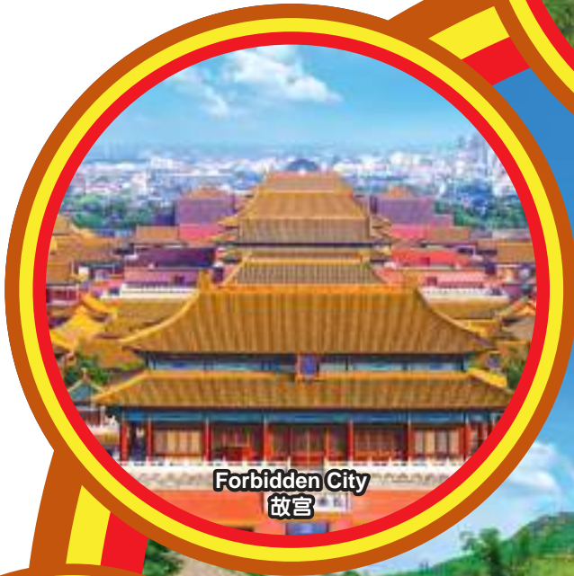
Forbidden City 故宫