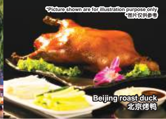
Beijing roast duck 北京烤鸭