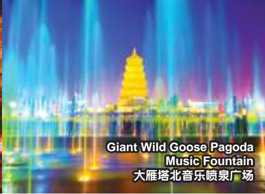
Giant Wild Goose Pagoda Music Fountain 大雁塔北音乐喷泉广场