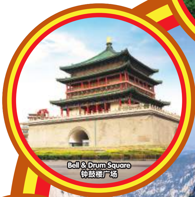
Bell & Drum Square 钟鼓楼广场