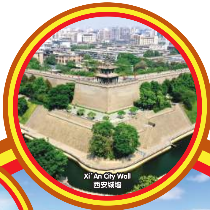
Xi' An City Wall 西安城墙