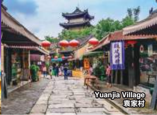
Yuanjia Village 袁家村