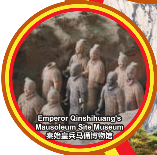
Emperor Qinshihuang's Mausoleum Site Museum 秦始皇兵马俑博物馆