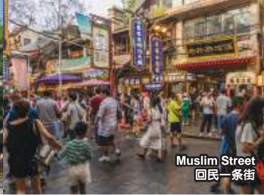
Muslim Street 回民一条街