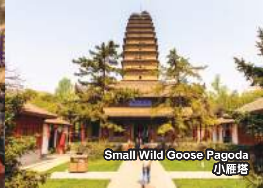
Small Wild Goose Pagoda 小雁塔