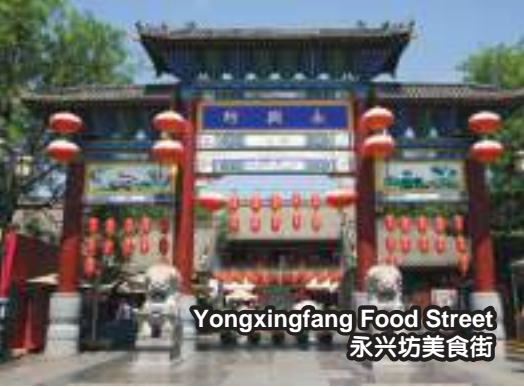
Yongxingfang Food Street 永兴坊美食街