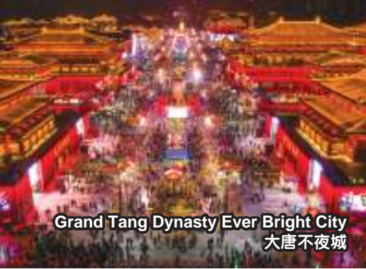
Grand Tang Dynasty Ever Bright City 大唐不夜城