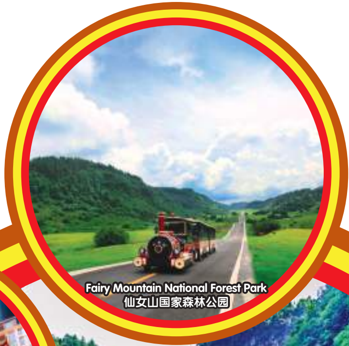
Fairy Mountain National Forest Park 仙女山国家森林公园