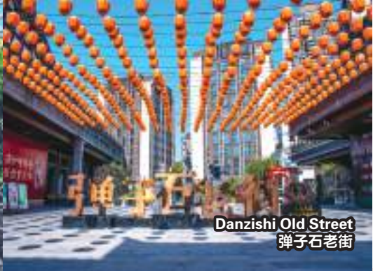
Danzishi Old Street 弹子石老街