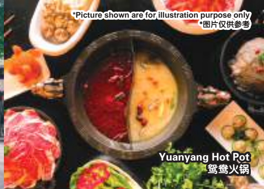
Yuanyang Hot Pot 鸳鸯火锅

*Picture shown are for illustration purpose only *图片仅供参考