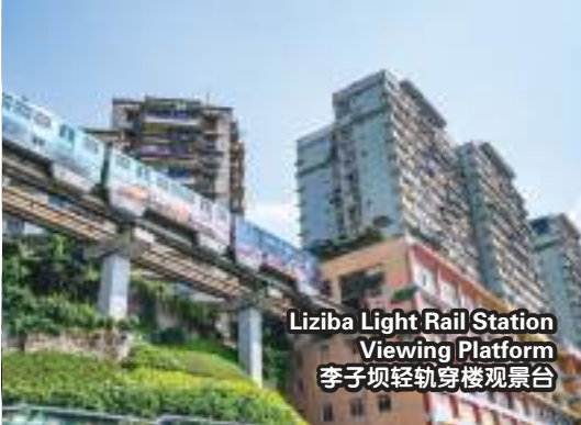
Liziba Light Rail Station Viewing Platform 李子坝轻轨穿楼观景台