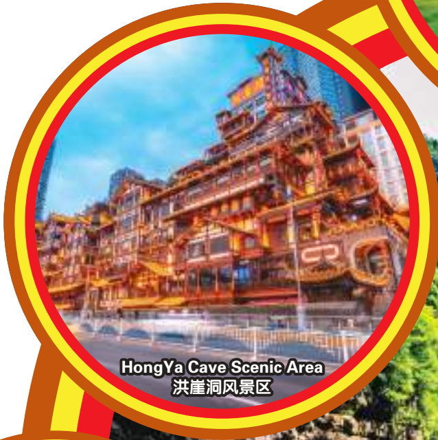
HongYa Cave Scenic Area 洪崖洞风景区