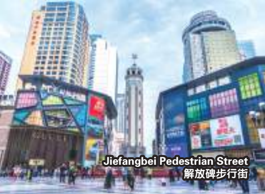
Jiefangbei Pedestrian Street 解放碑步行街