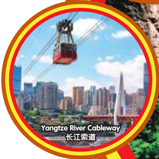
Yangtze River Cableway 长江索道