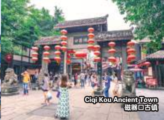
Ciqi Kou Ancient Town 磁器口古镇