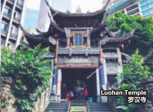
Luohan Temple 罗汉寺