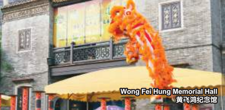
Wong Fei Hung Memorial Hall 黄飞鸿纪念馆