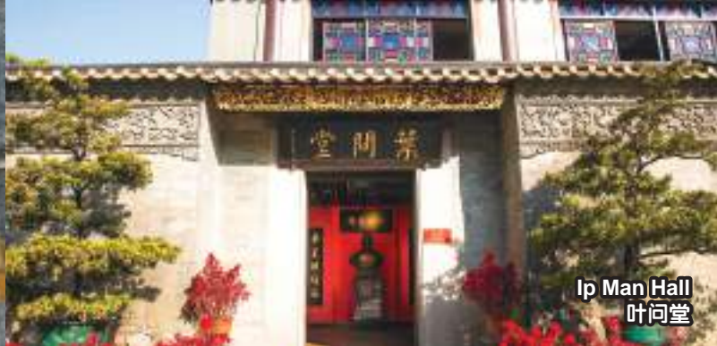
Ip Man Hall 叶问堂