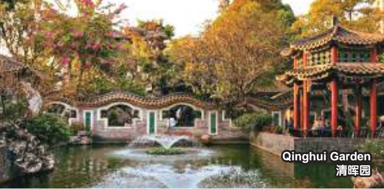
Qinghui Garden 清晖园