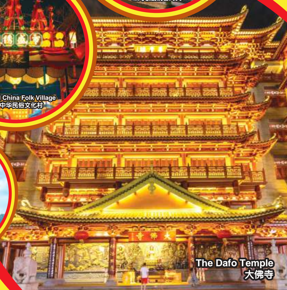
The Dafo Temple 大佛寺

行程次序，以当地旅社安排为准。 Sequences of itinerary are subject to local arrangement.