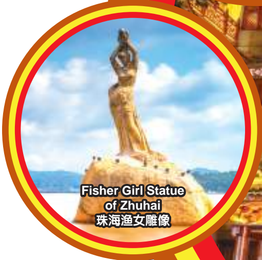
Fisher Girl Statue of Zhuhai 珠海渔女雕像