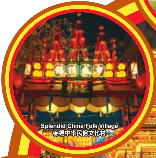
Splendid China Folk Village 锦绣中华民俗文化村