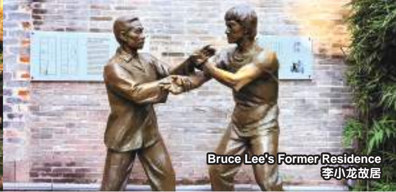
Bruce Lee's Former Residence 李小龍故居