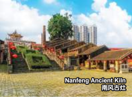
Nanfeng Ancient Kiln 南风古灶