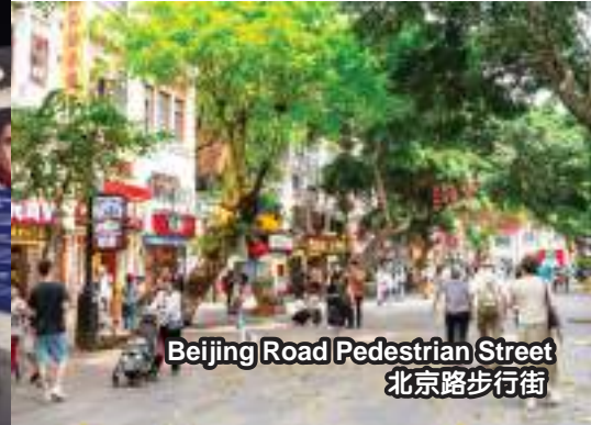
Beijing Road Pedestrian Street 北京路步行街