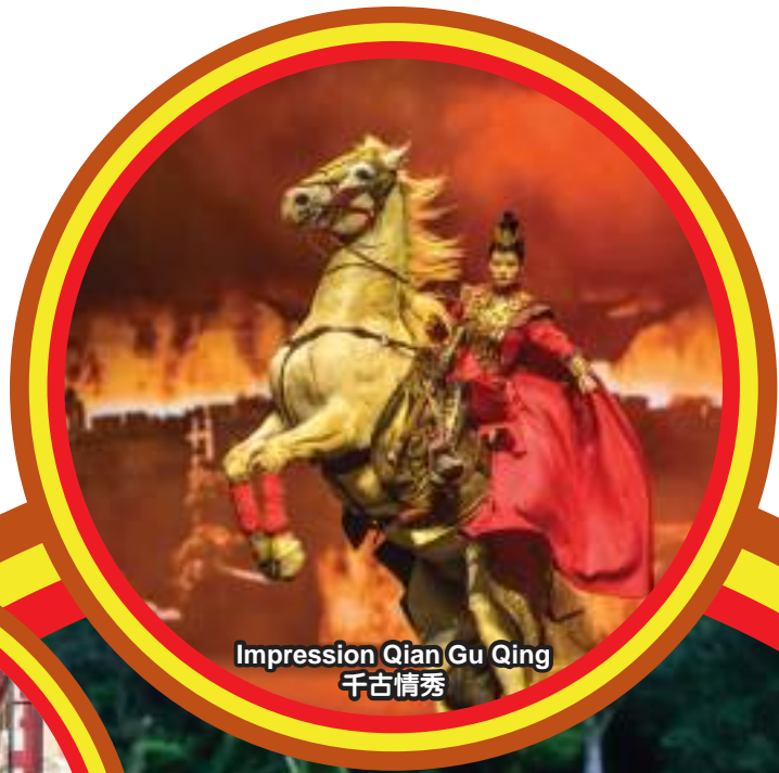
Impression Qian Gu Qing 千古情秀