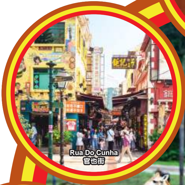
Rua Do Cunha 官也街