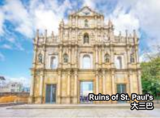
Ruins of St. Paul's 大三巴