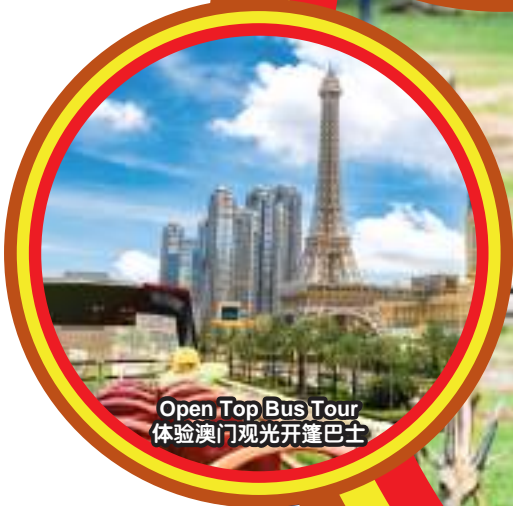
Open Top Bus Tour 体验澳门观光开篷巴士

行程次序，以当地旅社安排为准。 Sequences of Itinerary are subject to local arrangement.