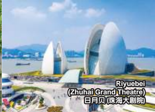
Riyuebei (Zhuhai Grand Theatre) 日月贝(珠海大剧院)