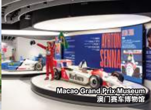
Macao Grand Prix Museum 澳门赛车博物馆