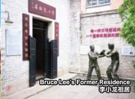
Bruce Lee's Former Residence 李小龙祖居