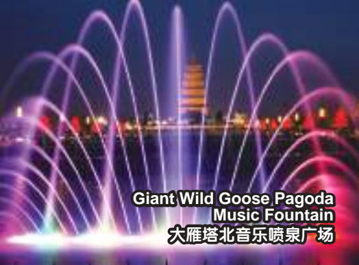
Giant Wild Goose Pagoda Music Fountain 大雁塔北音乐喷泉广场