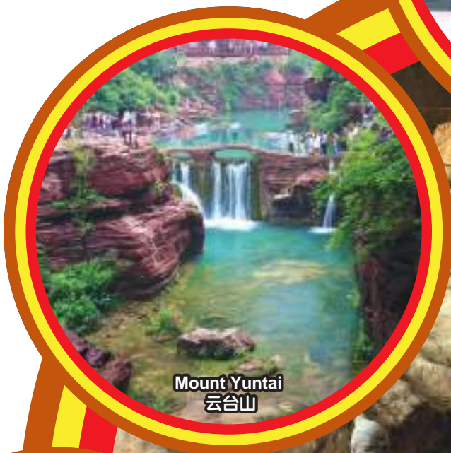
Mount Yuntai 云台山