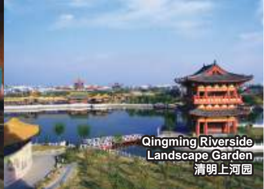
Qingming Riverside Landscape Garden 清明上河园