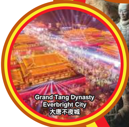
Grand Tang Dynasty Everbright City 大唐不夜城