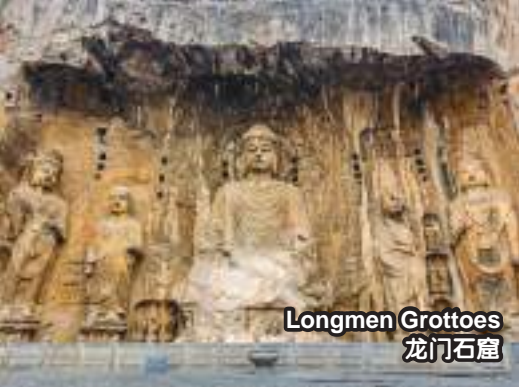
Longmen Grottoes 龙门石窟