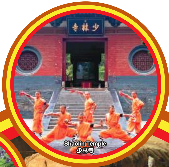
Shaolin Temple 少林寺