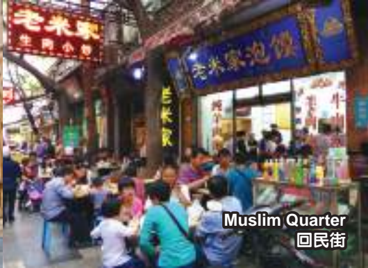
Muslim Quarter 回民街