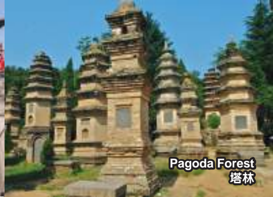
Pagoda Forest 塔林