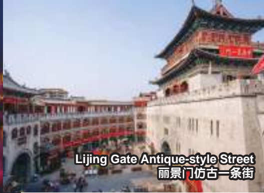
Lijing Gate Antique-style Street 丽景门仿古一条街