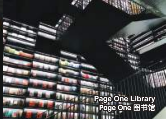
Page One Library Page One 图书馆