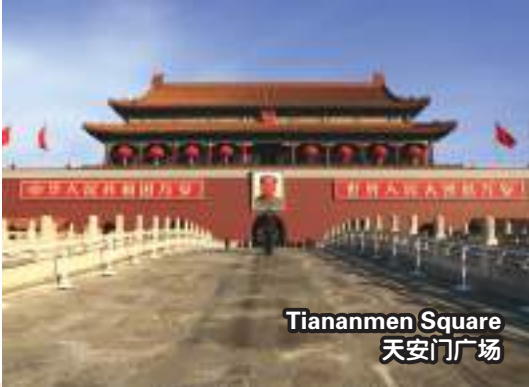
Tiananmen Square 天安门广场