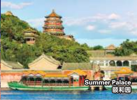
Summer Palace 颐和园