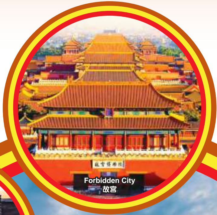
Forbidden City 故宫