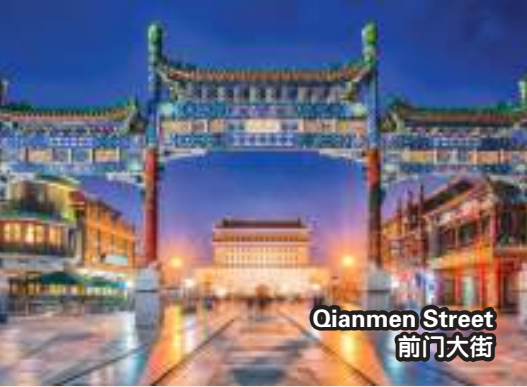
Qianmen Street 前门大街