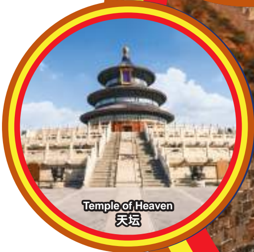
Temple of Heaven 天坛