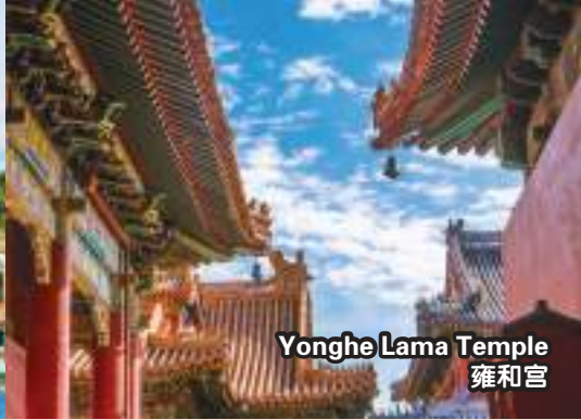
Yonghe Lama Temple 雍和宫