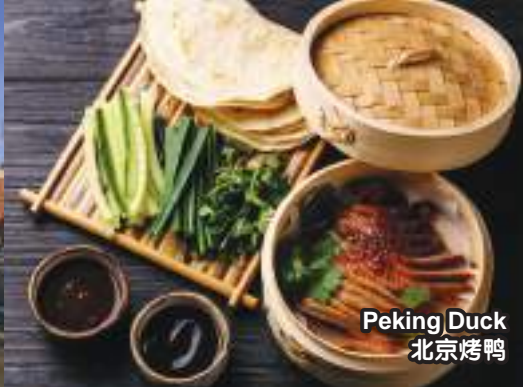
Peking Duck 北京烤鸭