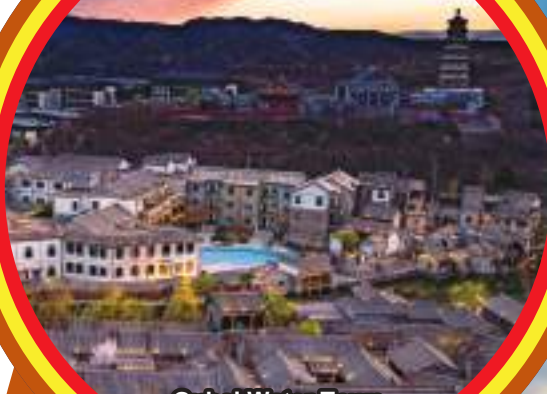
Gubei Water Town 古北水镇