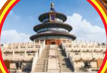
Temple of Heaven 天坛