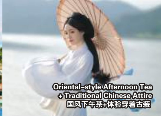
Oriental-style Afternoon Tea + Traditional Chinese Attire 国风下午茶+体验穿着古装