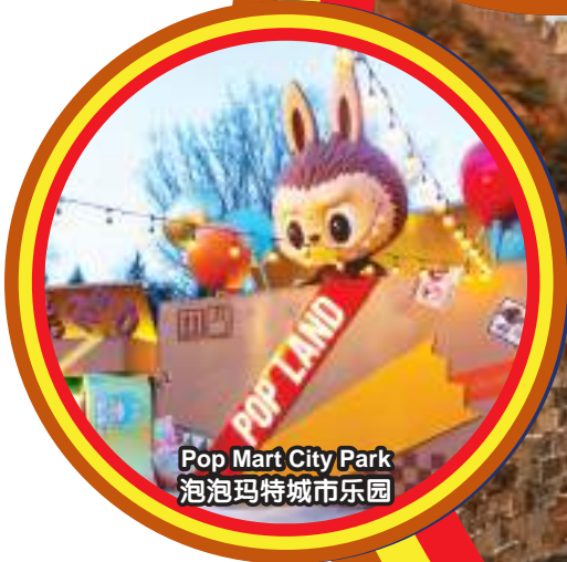
Pop Mart City Park 泡泡玛特城市乐园