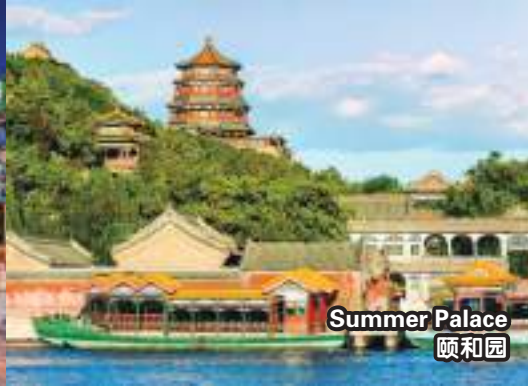
Summer Palace 颐和园