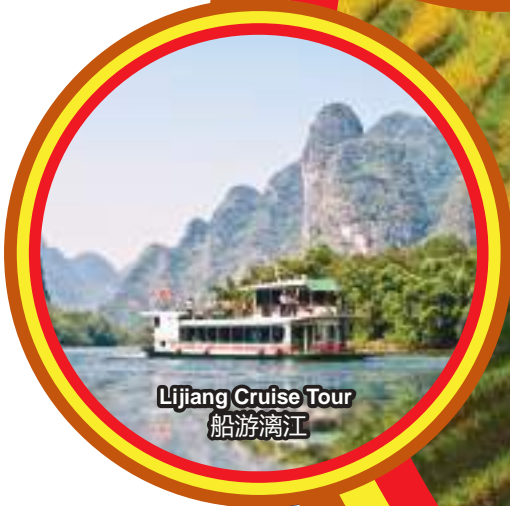
Lijiang Cruise Tour 船游漓江