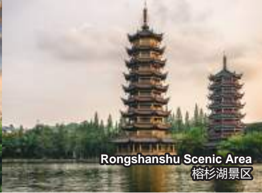
Rongshanshu Scenic Area 榕杉湖景区