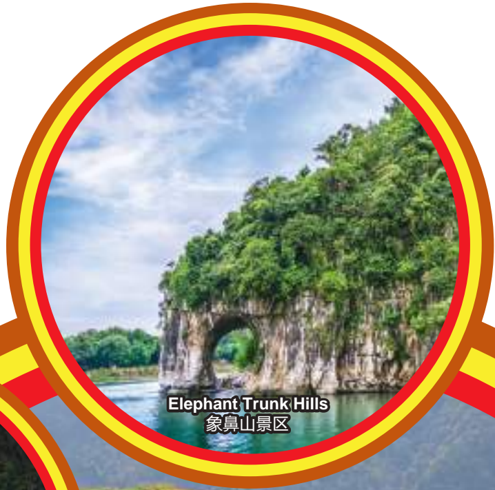
Elephant Trunk Hills 象鼻山景区