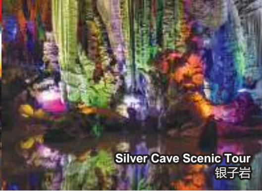
Silver Cave Scenic Tour 银子岩