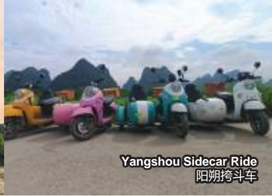
Yangshou Sidecar Ride 阳朔跨斗车