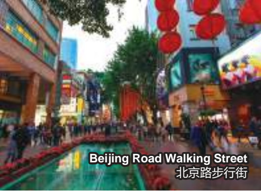
Beijing Road Walking Street 北京路步行街