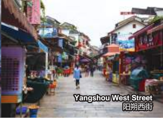
Yangshou West Street 阳朔西街