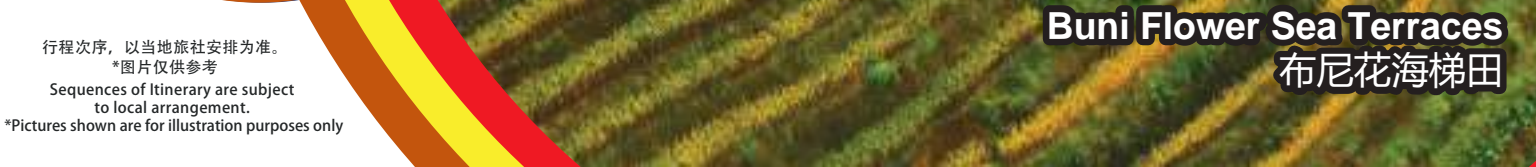
Buni Flower Sea Terraces 布尼花海梯田