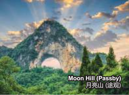
Moon Hill (Passby) 月亮山 (途观)