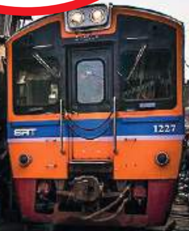
Maeklong Railway Market 铁路市场

行程次序，以当地旅社安排为准。 Sequences of Itinerary are subject to local arrangement.