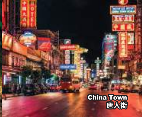
China Town 唐人街