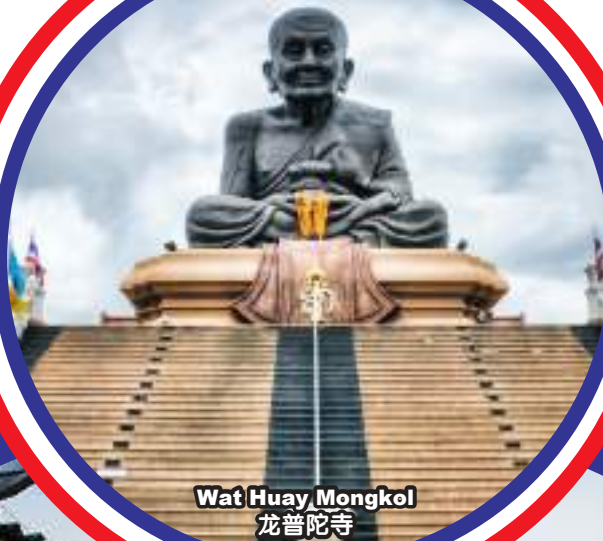
Wat Huay Mongkol 龙普陀寺