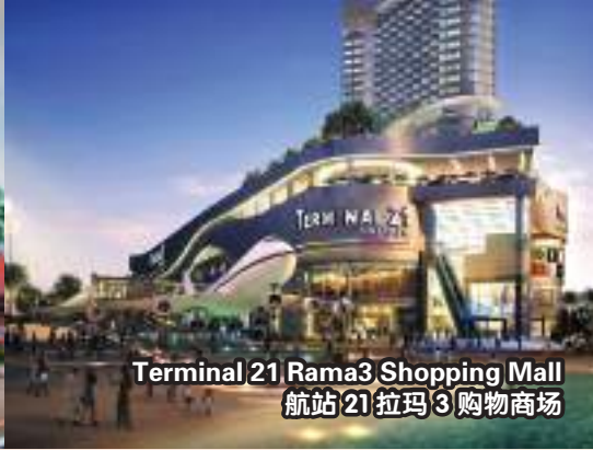
Terminal 21 Rama3 Shopping Mall 航站21拉玛3购物商场