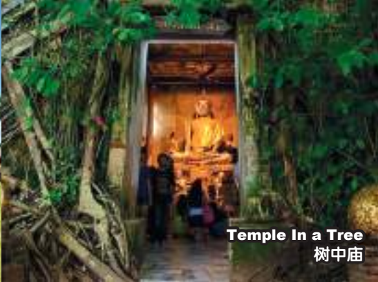
Temple In a Tree 树中庙