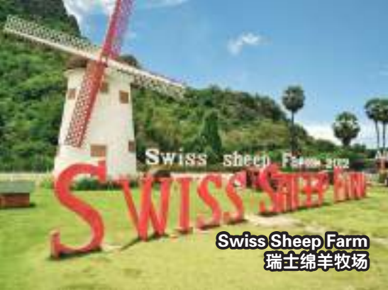
Swiss Sheep Farm 瑞士绵羊牧场