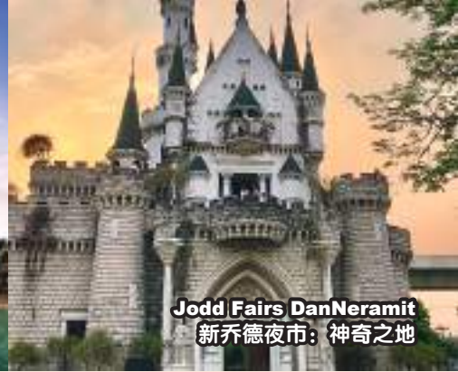
Jodd Fairs DanNeramit 新乔德夜市: 神奇之地