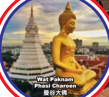
Wat Paknam Phasi Charoen 曼谷大佛