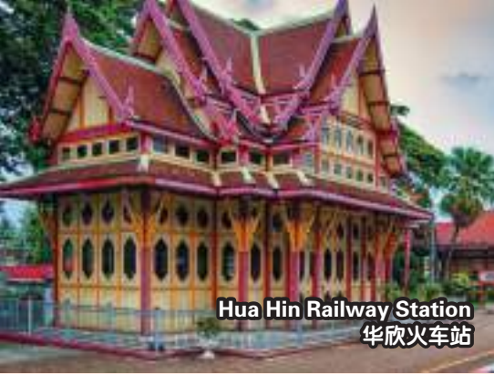
Hua Hin Railway Station 华欣火车站