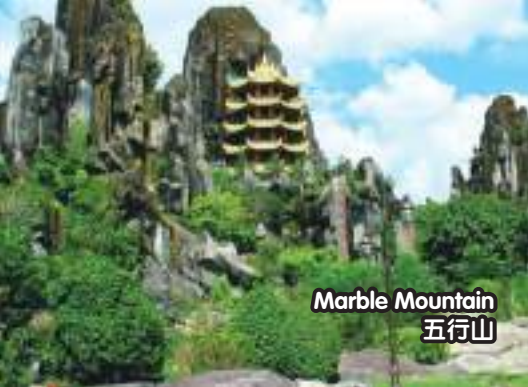
Marble Mountain 五行山