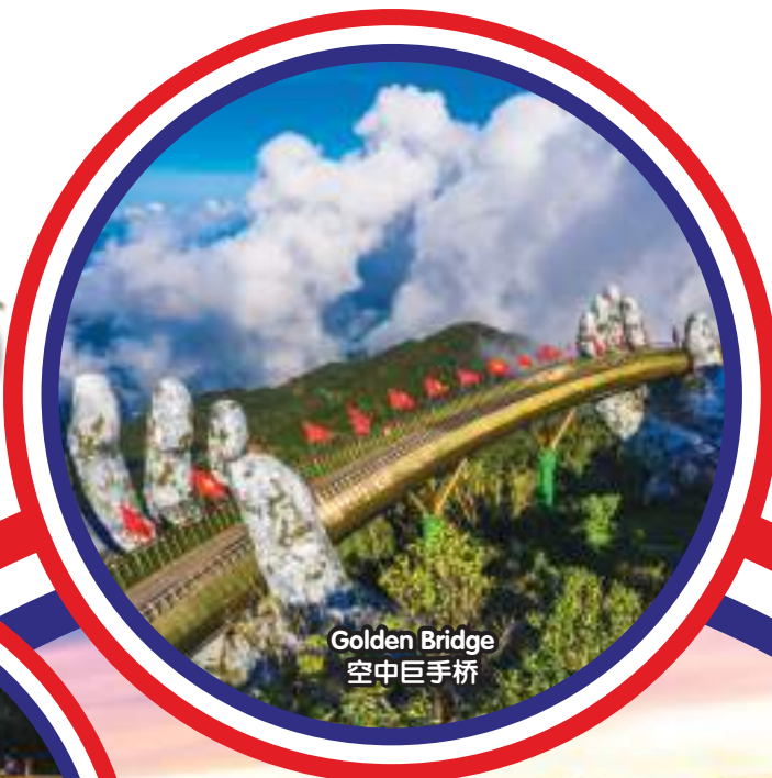
Golden Bridge 空中巨手桥