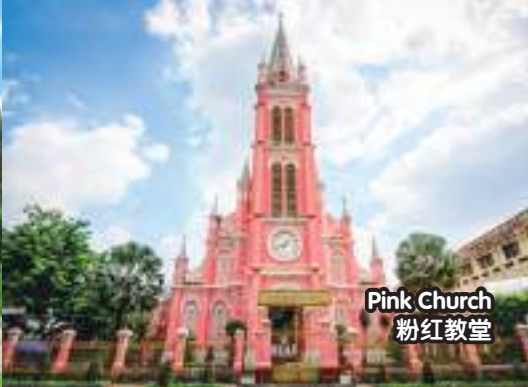
Pink Church 粉红教堂