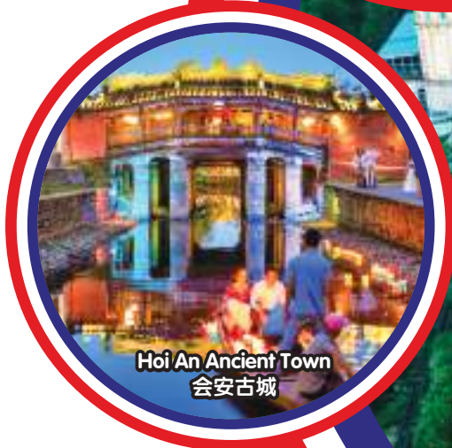
Hoi An Ancient Town 会安古城