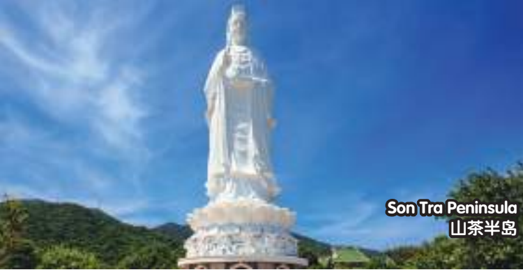
Son Tra Peninsula 山茶半岛