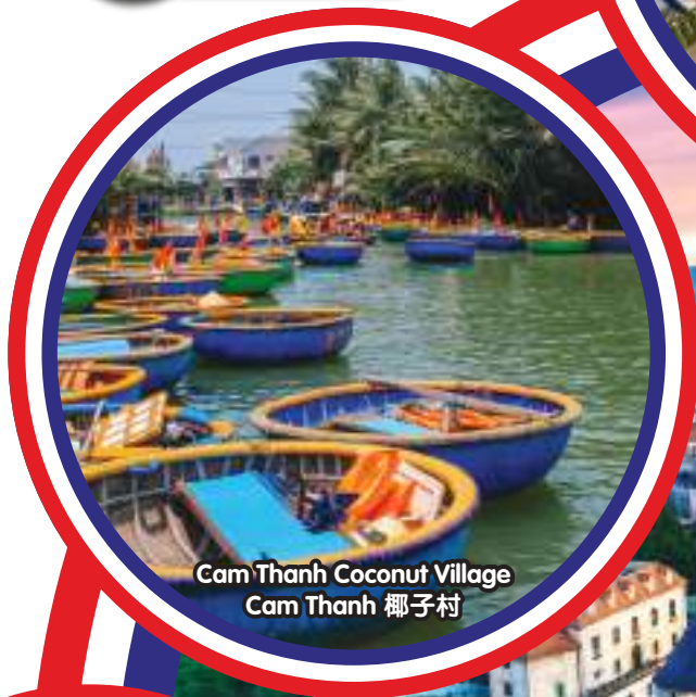
Cam Thanh Coconut Village Cam Thanh 椰子村