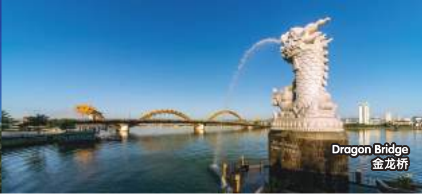
Dragon Bridge 金龙桥