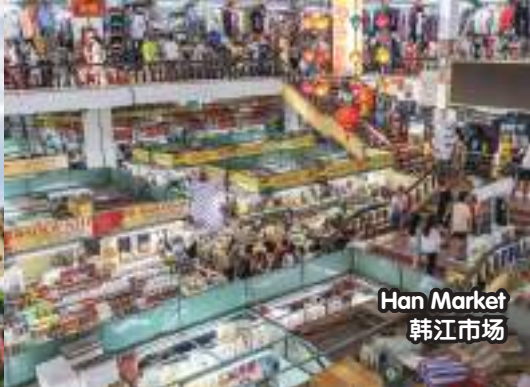
Han Market 韩江市场