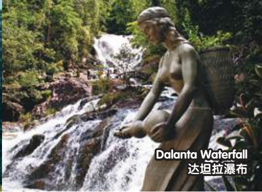
Dalanta Waterfall 达坦拉瀑布