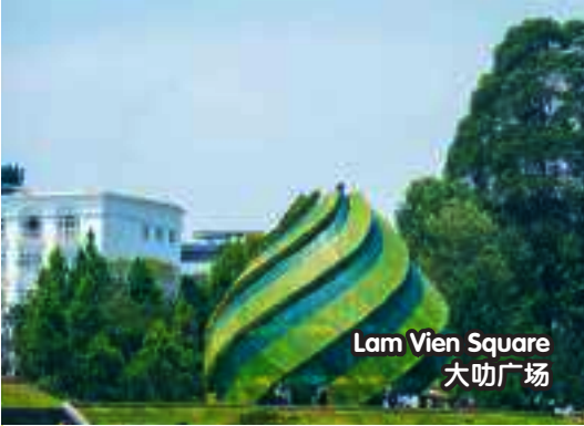
Lam Vien Square 大叻广场