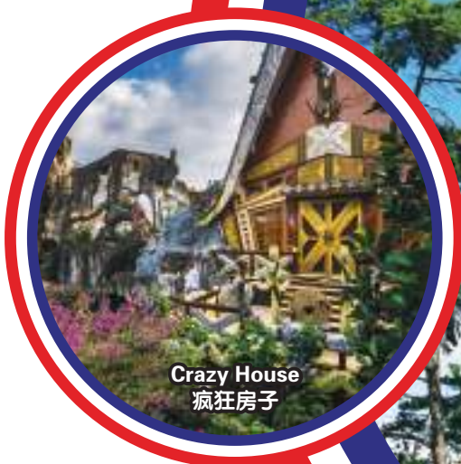
Crazy House 疯狂房子