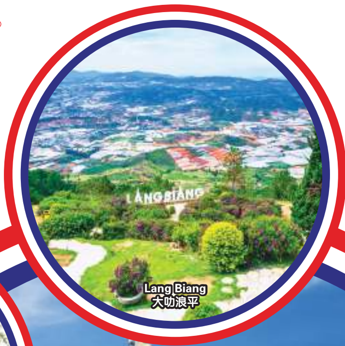
Lang Biang 大叻浪平