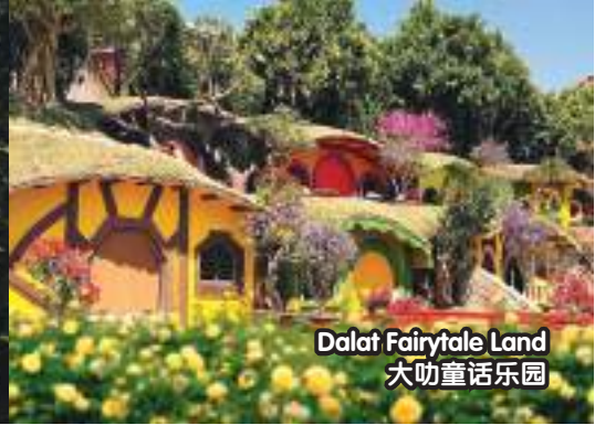
Dalat Fairytale Land 大叻童话乐园