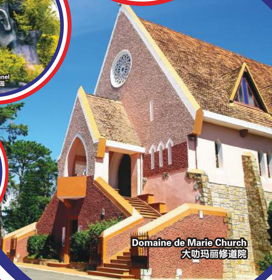
Domaine de Marie Church 大叻玛丽修道院

行程次序, 以当地旅社安排为准。 Sequences of Itinerary are subject to local arrangement.