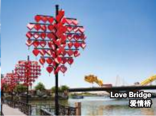
Love Bridge 爱情桥