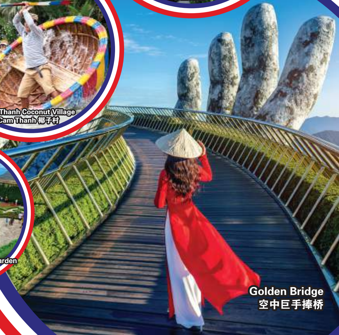
Golden Bridge 空中巨手捧桥