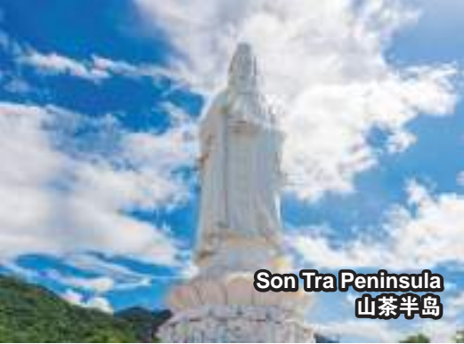
Son Tra Peninsula 山茶半岛