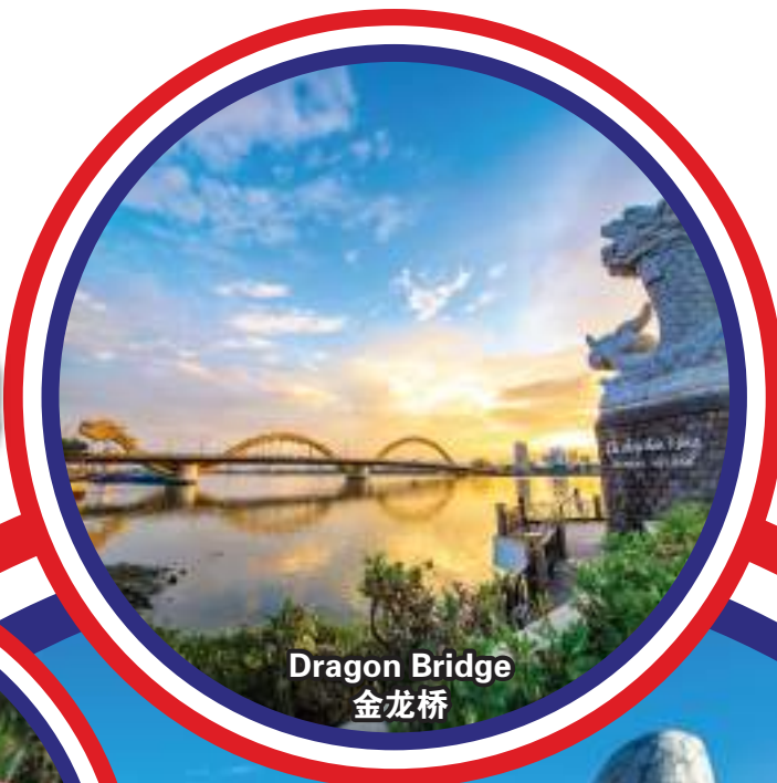
Dragon Bridge 金龙桥