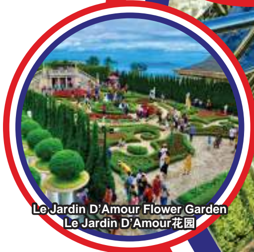
Le Jardin D'Amour Flower Garden Le Jardin D'Amour 花园