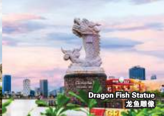
Dragon Fish Statue 龙鱼雕像