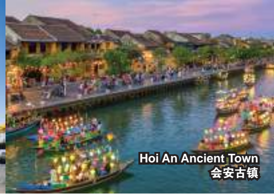
Hoi An Ancient Town 会安古镇