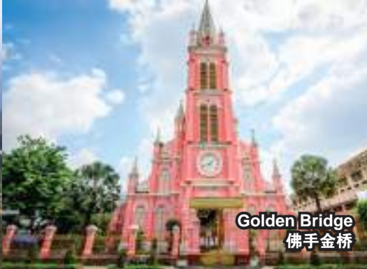
Golden Bridge 佛手金桥