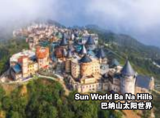
Sun World Ba Na Hills 巴纳山太阳世界