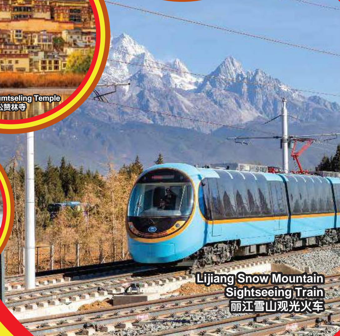
Lijiang Snow Mountain Sightseeing Train 丽江雪山观光火车

行程次序, 以当地旅社安排为准。 Sequences of Itinerary are subject to local arrangement.