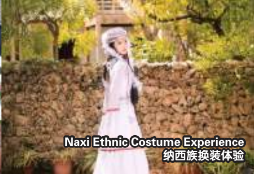
Naxi Ethnic Costume Experience 纳西族换装体验