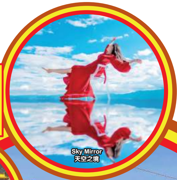
Sky Mirror 天空之境