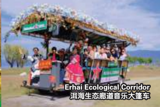
Erhai Ecological Corridor 洱海生态廊道音乐大篷车