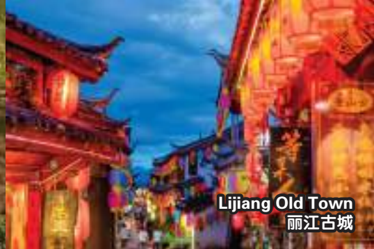
Lijiang Old Town 丽江古城