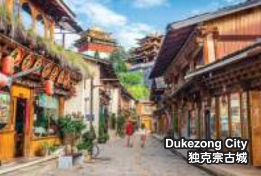
Dukezong City 独克宗古城