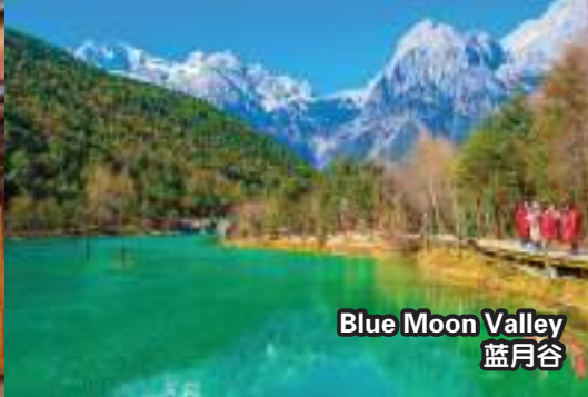
Blue Moon Valley 蓝月谷