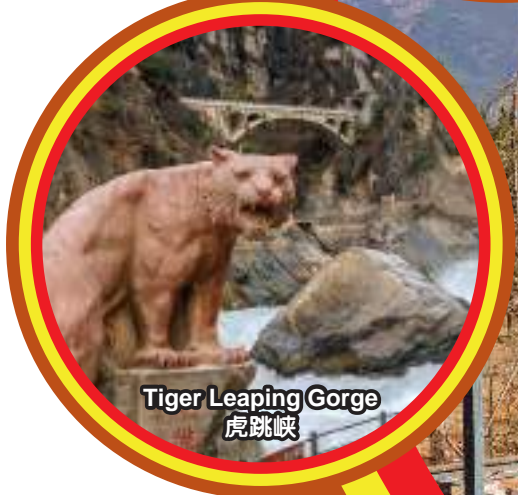
Tiger Leaping Gorge 虎跳峡