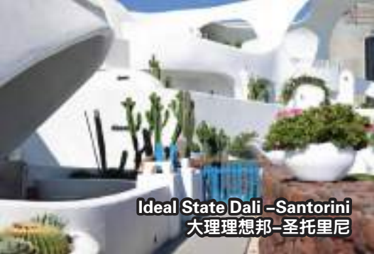
Ideal State Dali –Santorini 大理理想邦-圣托里尼