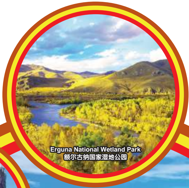
Erguna National Wetland Park 额尔古纳国家湿地公园