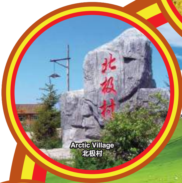
Arctic Village 北极村