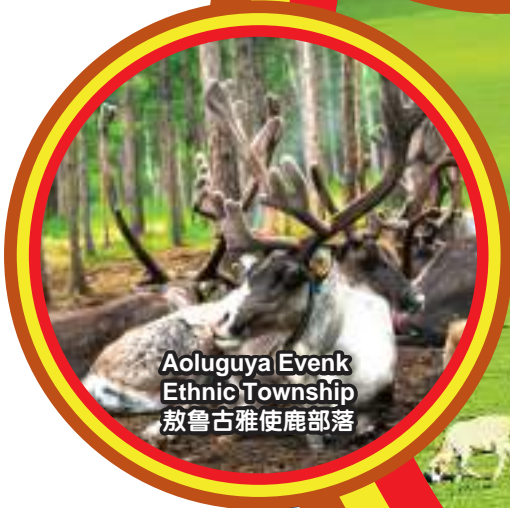
Aoluguya Evenk Ethnic Township 敖鲁古雅使鹿部落