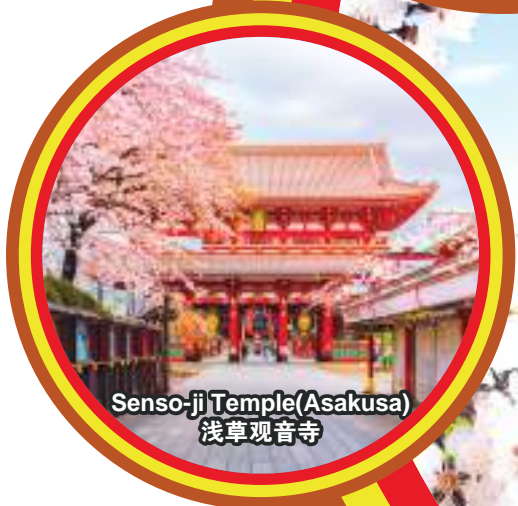
Senso-ji Temple (Asakusa) 浅草观音寺