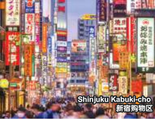
Shinjuku Kabuki-cho 新宿购物区