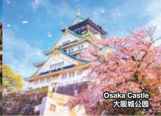
Osaka Castle 大阪城公园