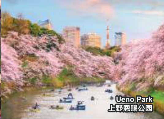
Ueno Park 上野恩赐公园