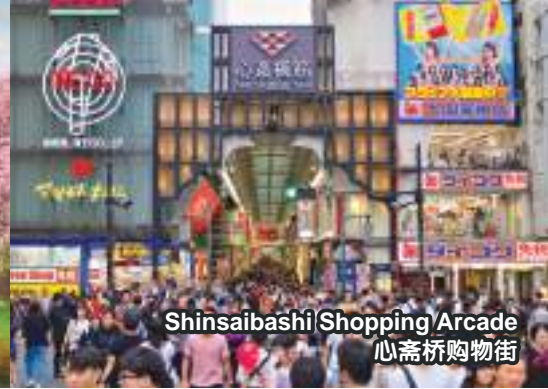
Shinsaibashi Shopping Arcade 心斋桥购物街