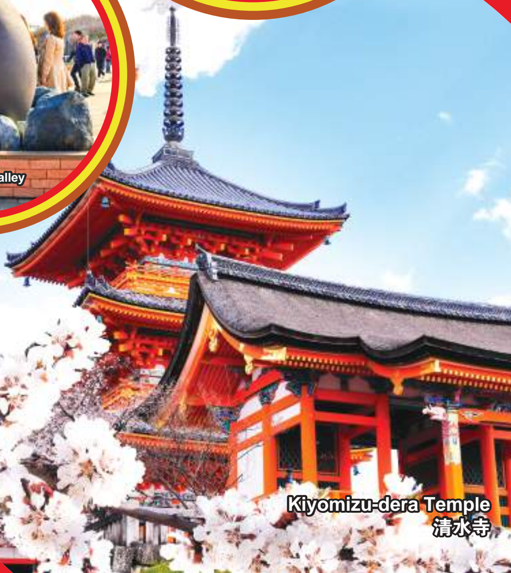
Kiyomizu-dera Temple 清水寺

行程次序, 以当地旅社安排为准。 Sequences of Itinerary are subject to local arrangement.