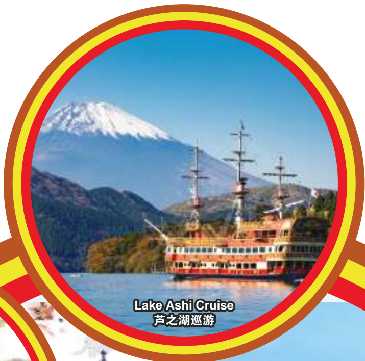
Lake Ashi Cruise 芦之湖巡游