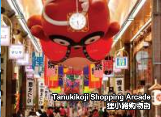
Tanukikoji Shopping Arcade 狸小路购物街