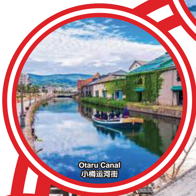
Otaru Canal 小樽运河街