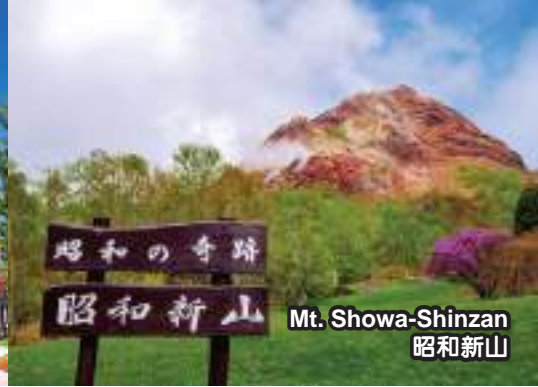
Mt. Showa-Shinzan 昭和新山