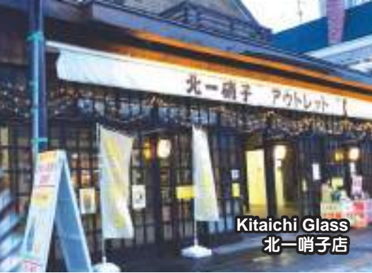
Kitaichi Glass 北一硝子店