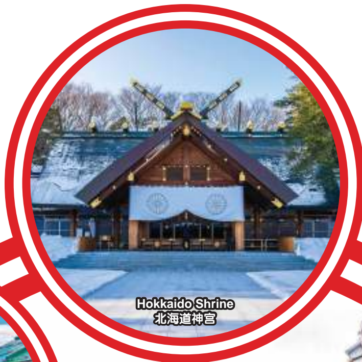
Hokkaido Shrine 北海道神宮