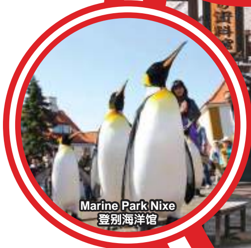
Marine Park Nixe 登别海洋馆