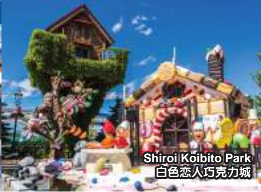
Shiroyi Koibito Park 白色恋人巧克力城