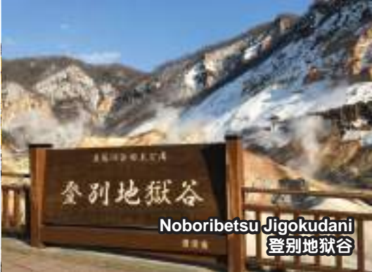
Noboribetsu Jigokudani 登别地狱谷