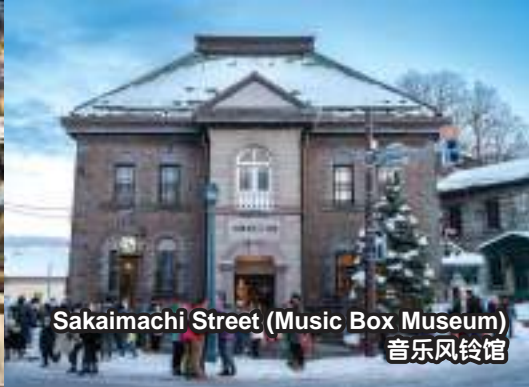
Sakaimachi Street (Music Box Museum) 音乐风铃馆