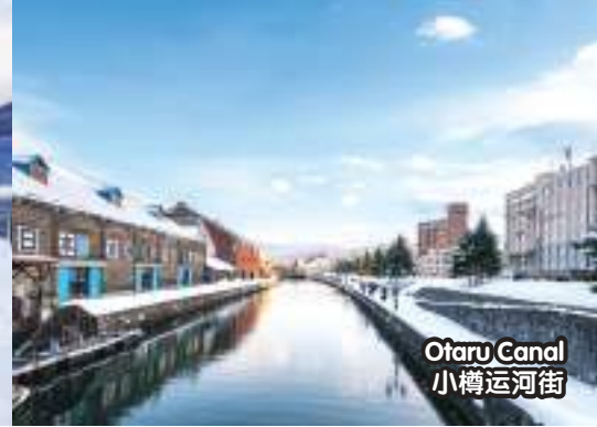
Otaru Canal 小樽运河街