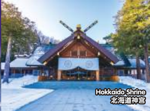
Hokkaido Shrine 北海道神宫