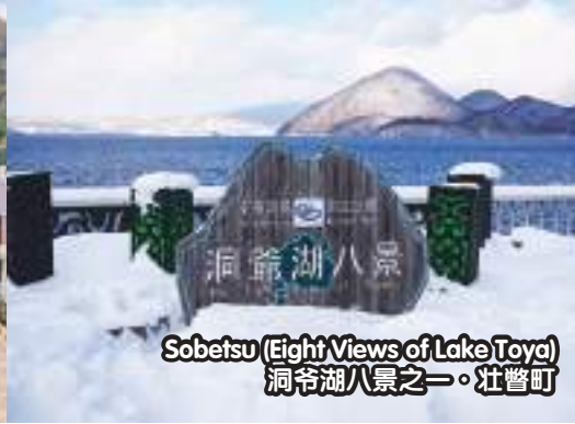
Sobetsu (Eight Views of Lake Toya) 洞爷湖八景之一・壮瞥町