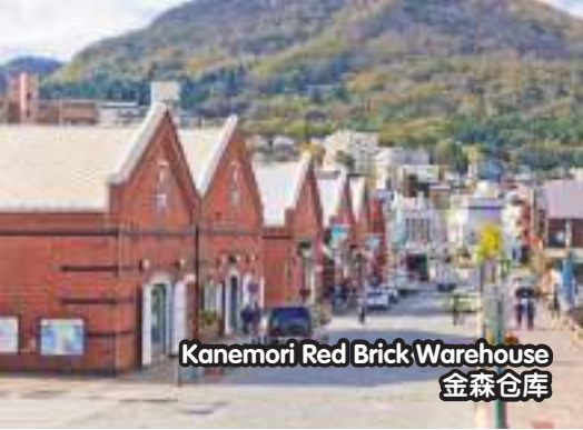
Kanemori Red Brick Warehouse 金森仓库