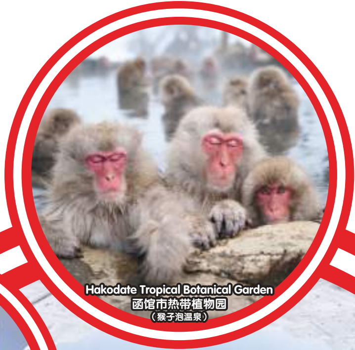
Hakodate Tropical Botanical Garden 函馆市热带植物园 (猴子泡温泉)