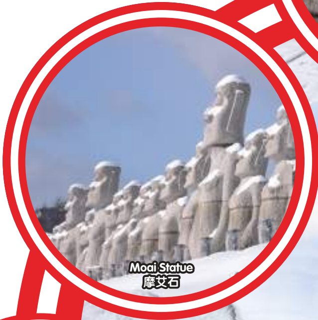
Moai Statue 摩艾石