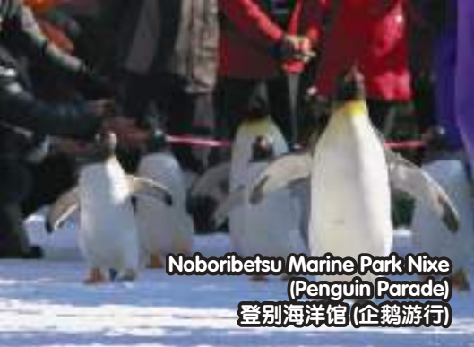
Noboribetsu Marine Park Nixe (Penguin Parade) 登别海洋馆(企鹅游行)