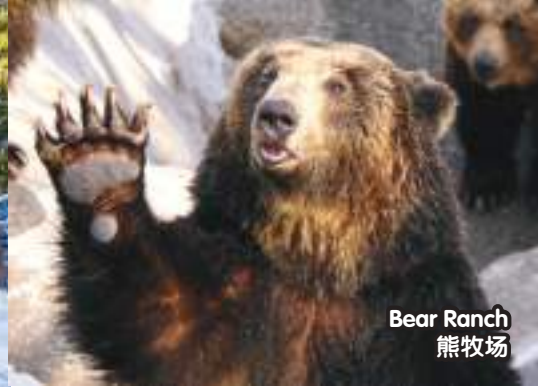
Bear Ranch 熊牧场