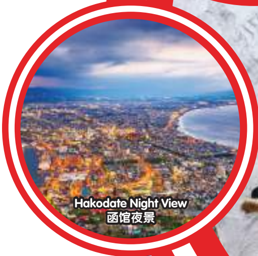
Hakodate Night View 函馆夜景