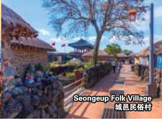
Seongeup Folk Village 城邑民俗村