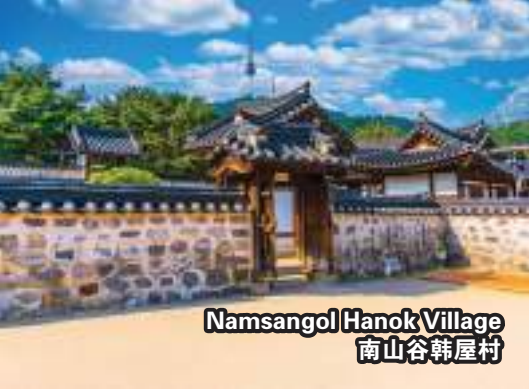
Namsangol Hanok Village 南山谷韩屋村