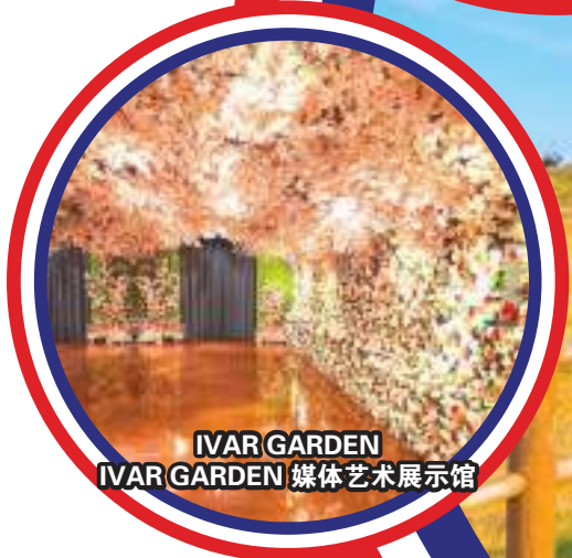
IVAR GARDEN IVAR GARDEN 媒体艺术展示馆