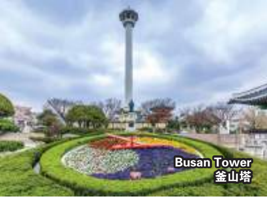
Busan Tower 釜山塔