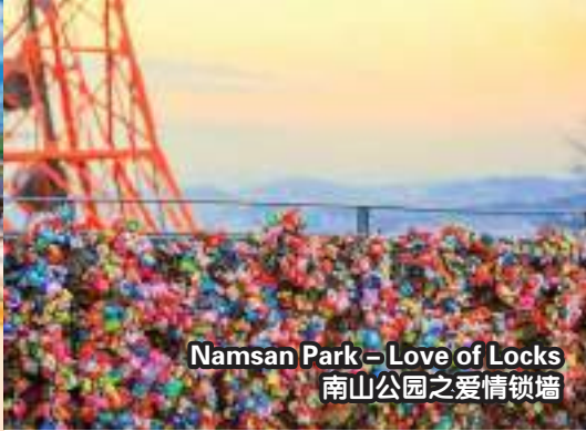
Namsan Park - Love of Locks 南山公园之爱情锁墙