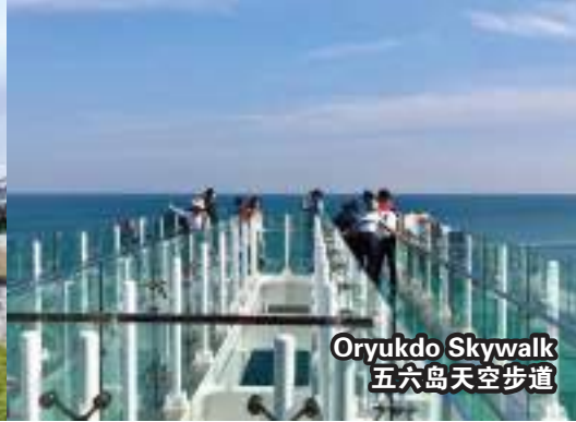
Oryukdo Skywalk 五六岛天空步道