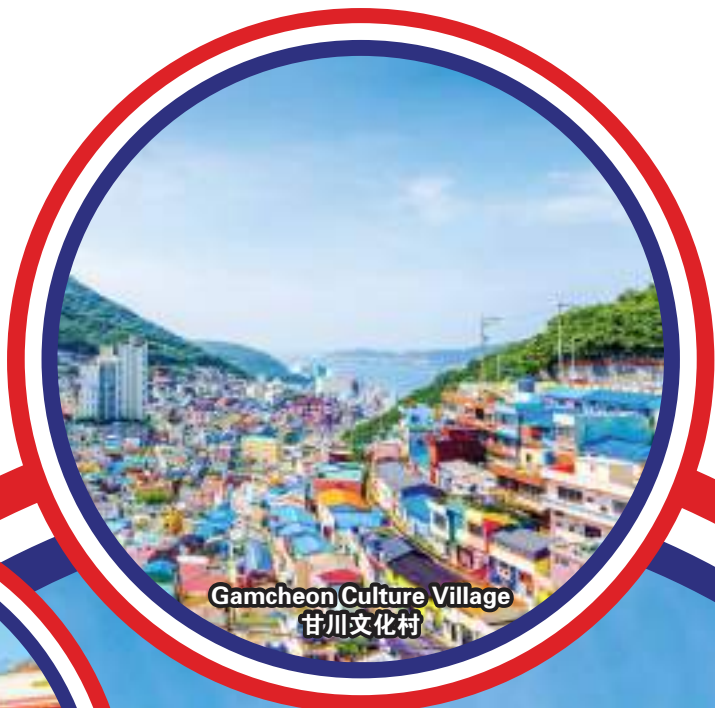
Gamcheon Culture Village 甘川文化村