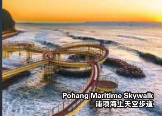
Pohang Maritime Skywalk 浦项海上天空步道