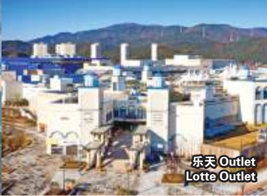
乐天 Outlet Lotte Outlet