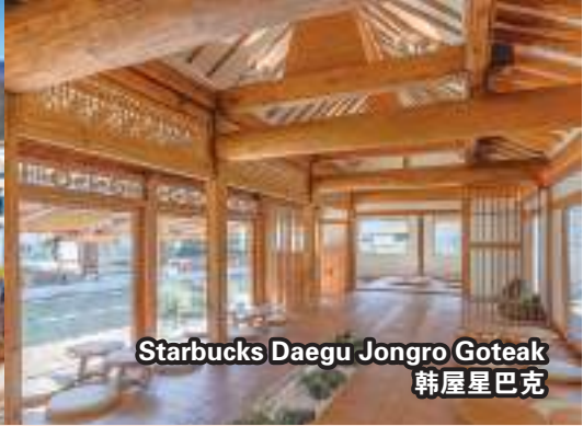
Starbucks Daegu Jongro Goteak 韩屋星巴克