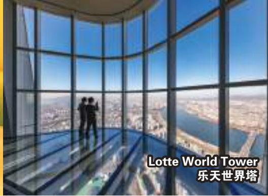
Lotte World Tower 乐天世界塔