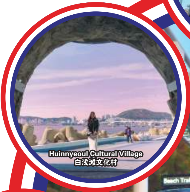
Huinnyeoul Cultural Village 白浅滩文化村