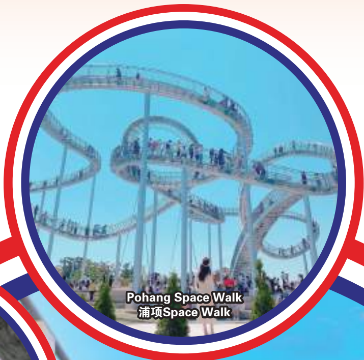
Pohang Space Walk 浦项Space Walk