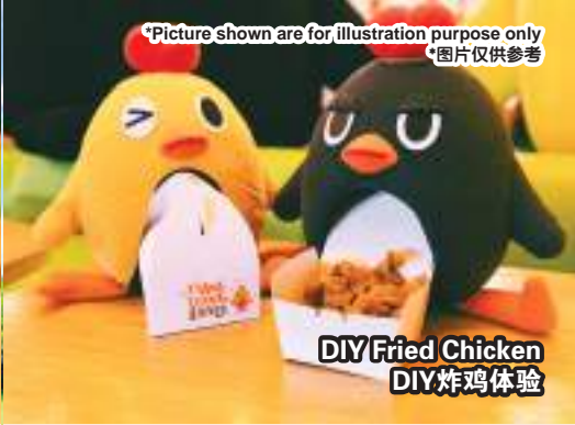
DIY Fried Chicken DIY炸鸡体验

*Picture shown are for illustration purpose only *图片仅供参考