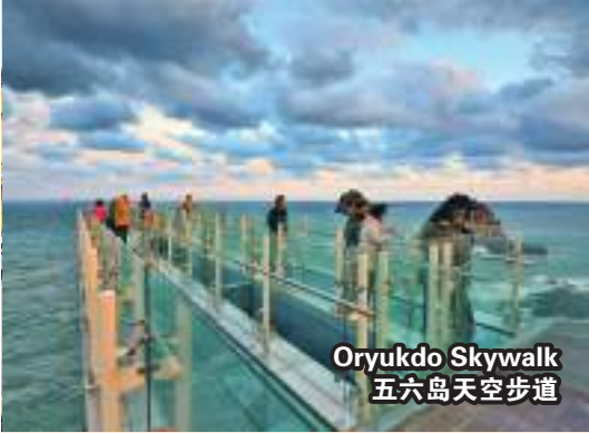
Oryukdo Skywalk 五六岛天空步道