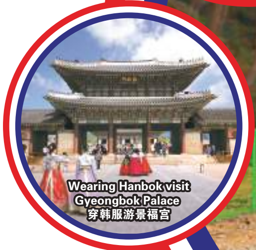
Wearing Hanbok visit Gyeongbok Palace 穿韩服游景福宫