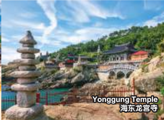
Yonggung Temple 海东龙宫寺