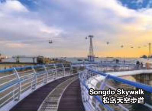
Songdo Skywalk 松岛天空步道