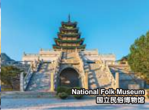
National Folk Museum 国立民俗博物馆