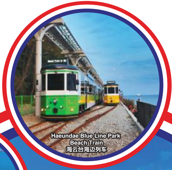
Haeundae Blue Line Park Beach Train 海云台海边列车