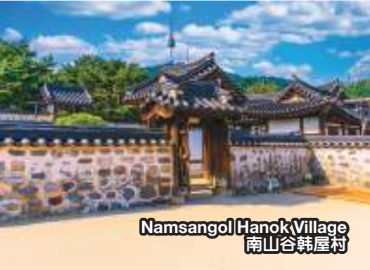
Namsangol Hanok Village 南山谷韩屋村