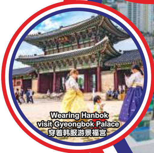
Wearing Hanbok visit Gyeongbok Palace 穿着韩服游景福宫

行程次序，以當地旅社安排為準。 Sequences of Itinerary are subject to local arrangement.