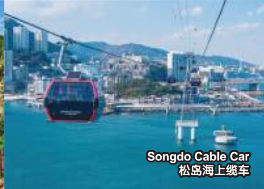
Songdo Cable Car 松岛海上缆车