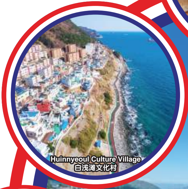
Huinnyeoul Culture Village 白浅滩文化村