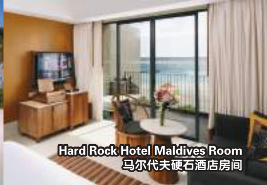
Hard Rock Hotel Maldives Room 马尔代夫硬石酒店房间