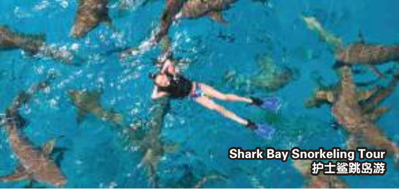
Shark Bay Snorkeling Tour 护士鲨跳岛游