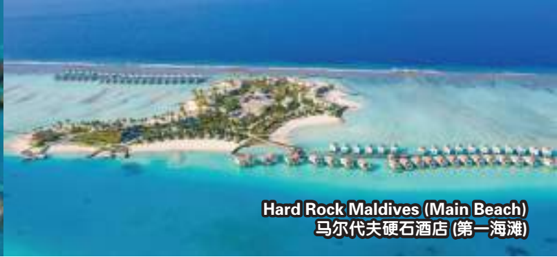
Hard Rock Maldives (Main Beach) 马尔代夫硬石酒店 (第一海滩)