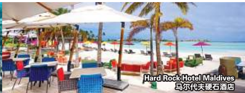
Hard Rock Hotel Maldives 马尔代夫硬石酒店

免责声明: 由于新冠肺炎疫情限制当地/ 宗教节日, 公众假期, 天气状况, 交通等情况, 自然灾害, 必要时黄金旅程保留对行程进行适当调整 (调整景点游览顺序) 以确保行程顺利进行, 会或否事先通知。