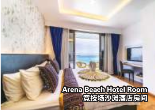
Arena Beach Hotel Room 竞技场沙滩酒店房间