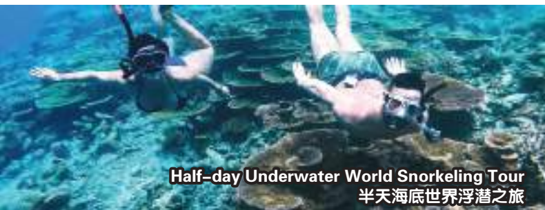
Half-day Underwater World Snorkeling Tour 半天海底世界浮潜之旅