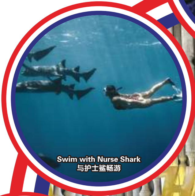
Swim with Nurse Shark 与护士鲨畅游