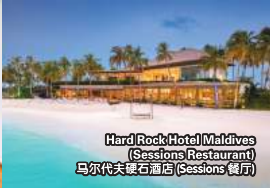
Hard Rock Hotel Maldives (Sessions Restaurant) 马尔代夫硬石酒店 (Sessions 餐厅)