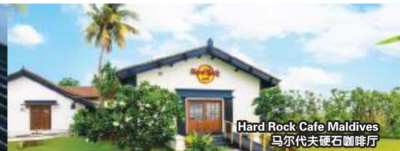
Hard Rock Cafe Maldives 马尔代夫硬石咖啡厅