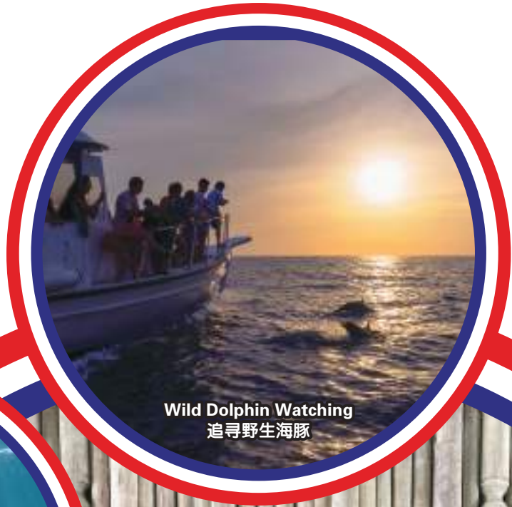
Wild Dolphin Watching 追寻野生海豚