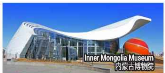
Inner Mongolia Museum 内蒙古博物院