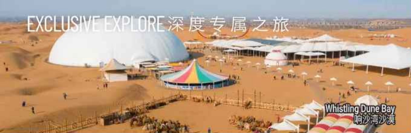
Whistling Dune Bay 响沙湾沙漠