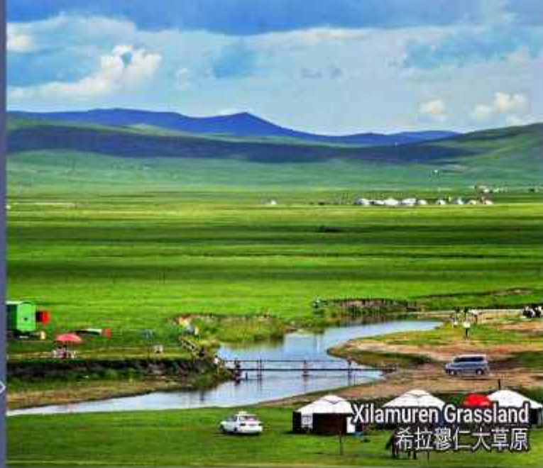
Xilamuren Grassland 希拉穆仁大草原