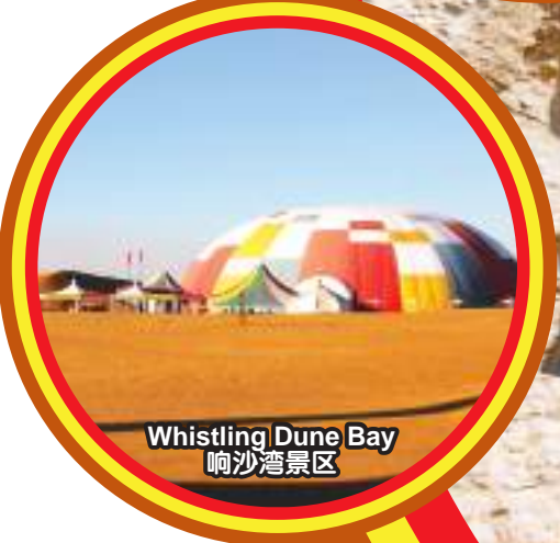
Whistling Dune Bay 响沙湾景区