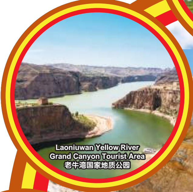
Laoniawan Yellow River Grand Canyon Tourist Area 老牛湾国家地质公园