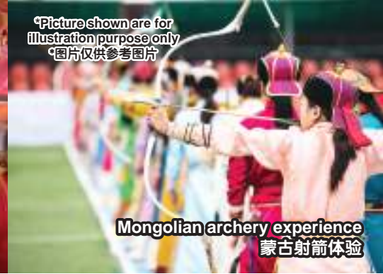
Mongolian archery experience 蒙古射箭体验

*Picture shown are for illustration purpose only *图片仅供参考图片