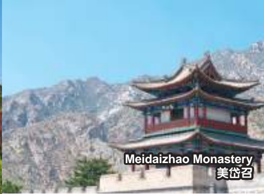
Meidaizhao Monastery 美岱召