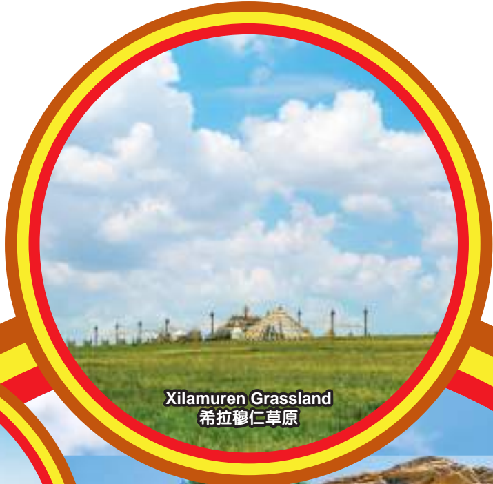
Xilamuren Grassland 希拉穆仁草原