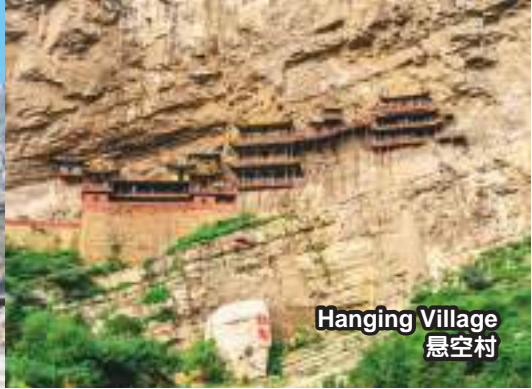
Hanging Village 悬空村