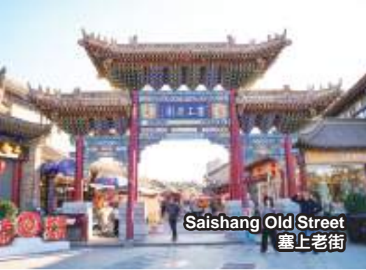
Saishang Old Street 塞上老街