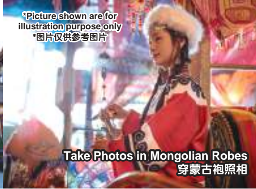
Take Photos in Mongolian Robes 穿蒙古袍照相