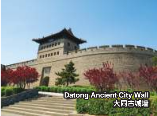
Datong Ancient City Wall 大同古城墙