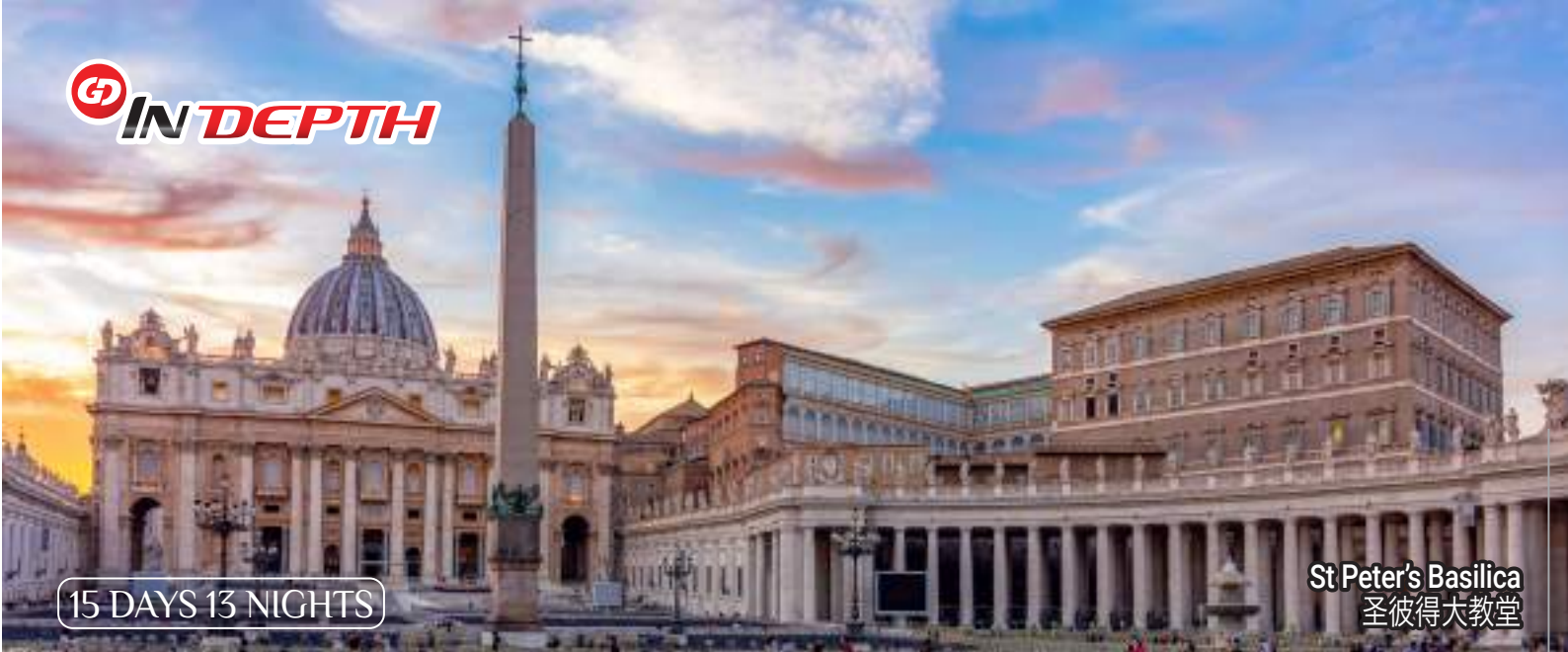
St Peter's Basilica 圣彼得大教堂