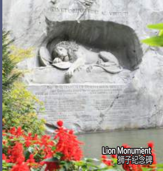
Lion Monument 狮子纪念碑