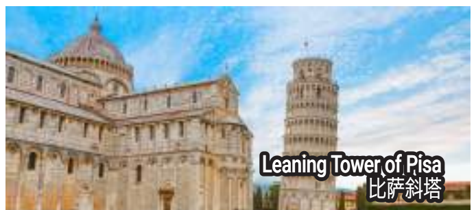
Leaning Tower of Pisa 比萨斜塔