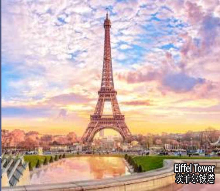
Eiffel Tower 埃菲尔铁塔