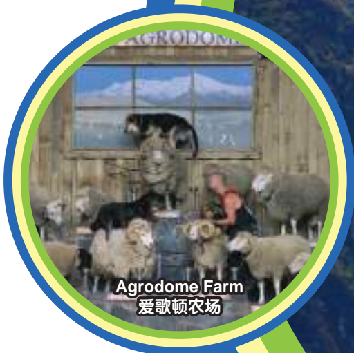
Agrodome Farm 爱歌顿农场