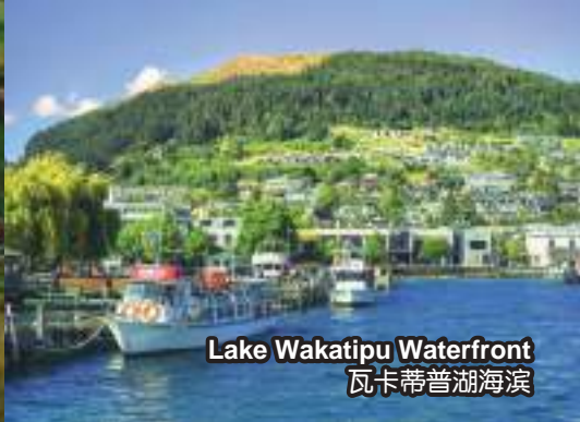
Lake Wakatipu Waterfront 瓦卡蒂普湖海滨