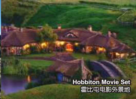
Hobbiton Movie Set 霍比屯电影外景地