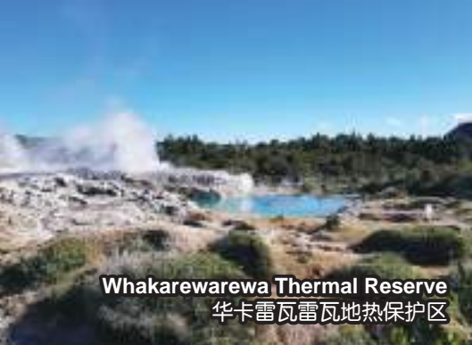
Whakarewarewa Thermal Reserve 华卡雷瓦雷瓦地热保护区