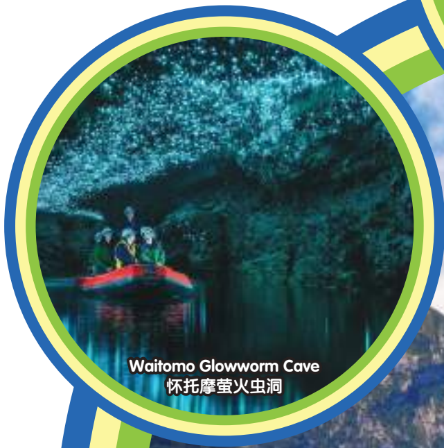
Waitomo Glowworm Cave 怀托摩萤火虫洞