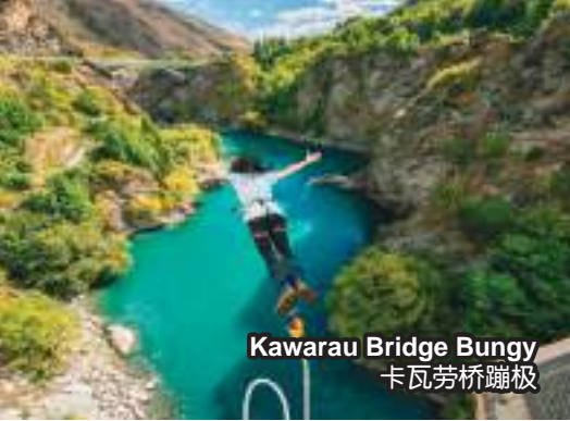
Kawarau Bridge Bungy 卡瓦劳桥蹦极