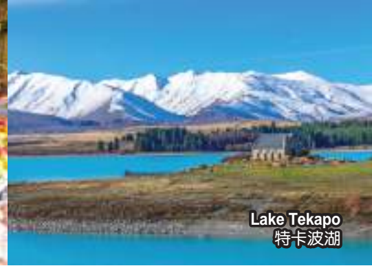
Lake Tekapo 特卡波湖