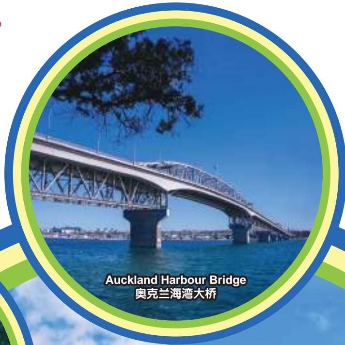
Auckland Harbour Bridge 奥克兰海湾大桥