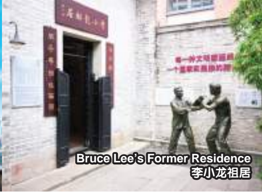
Bruce Lee's Former Residence 李小龙故居