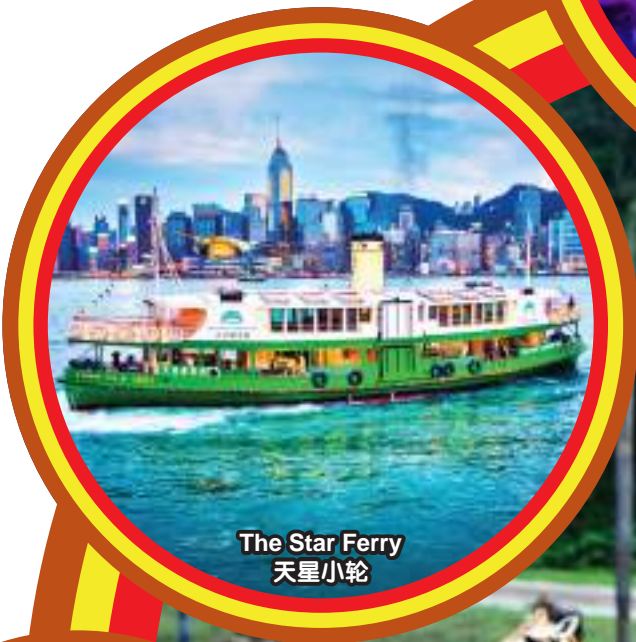
The Star Ferry 天星小轮