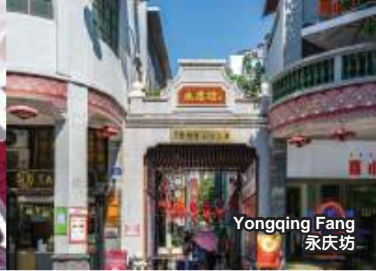
Yongqing Fang 永庆坊