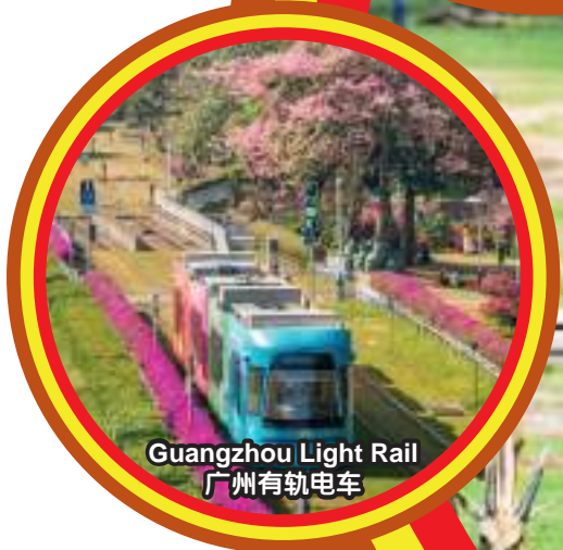
Guangzhou Light Rail 广州有轨电车