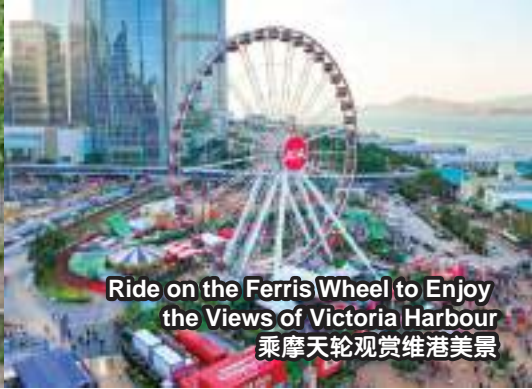
Ride on the Ferris Wheel to Enjoy the Views of Victoria Harbour 乘摩天轮观赏维港美景