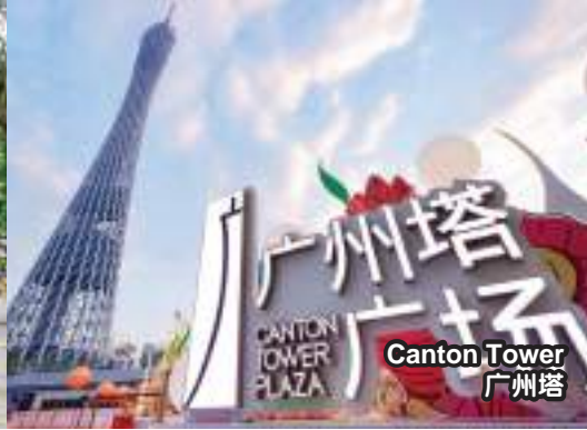
Canton Tower 广州塔