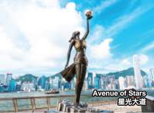
Avenue of Stars 星光大道