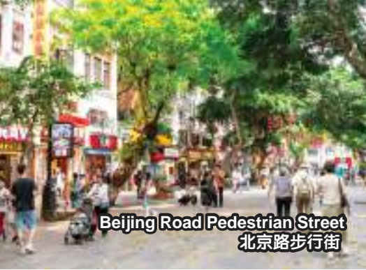
Beijing Road Pedestrian Street 北京路步行街