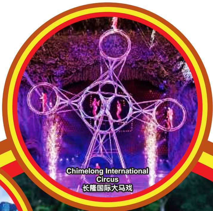
Chimelong International Circus 长隆国际大马戏