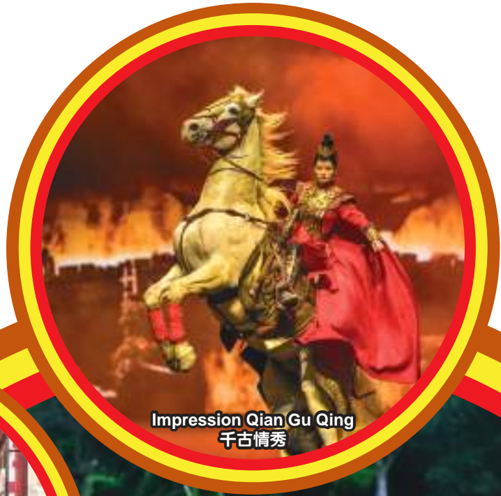
Impression Qian Gu Qing 千古情秀