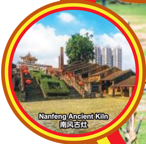
Nanfeng Ancient Kiln 南风古灶