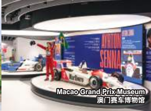
Macao Grand Prix Museum 澳门赛车博物馆