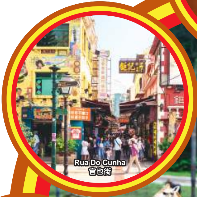
Rua Do Cunha 官也街