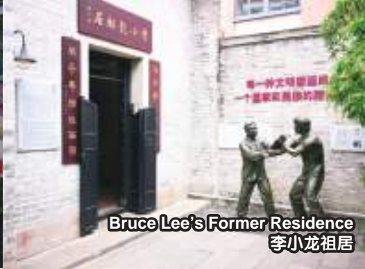
Bruce Lee's Former Residence 李小龙故居