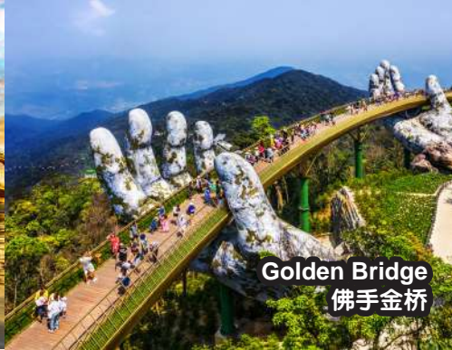
Golden Bridge 佛手金桥