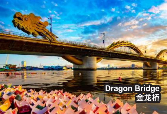
Dragon Bridge 金龙桥