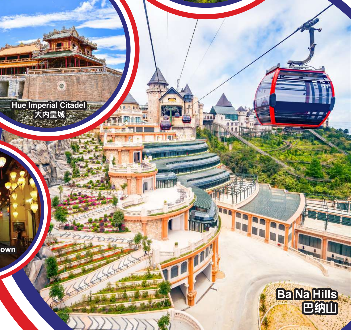
Ba Na Hills 巴纳山