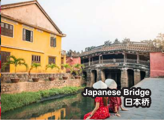
Japanese Bridge 日本桥