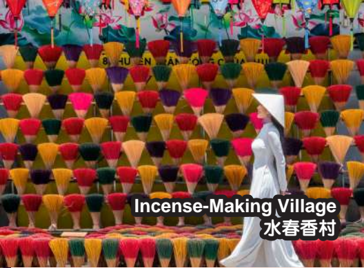
Incense-Making Village 水春香村