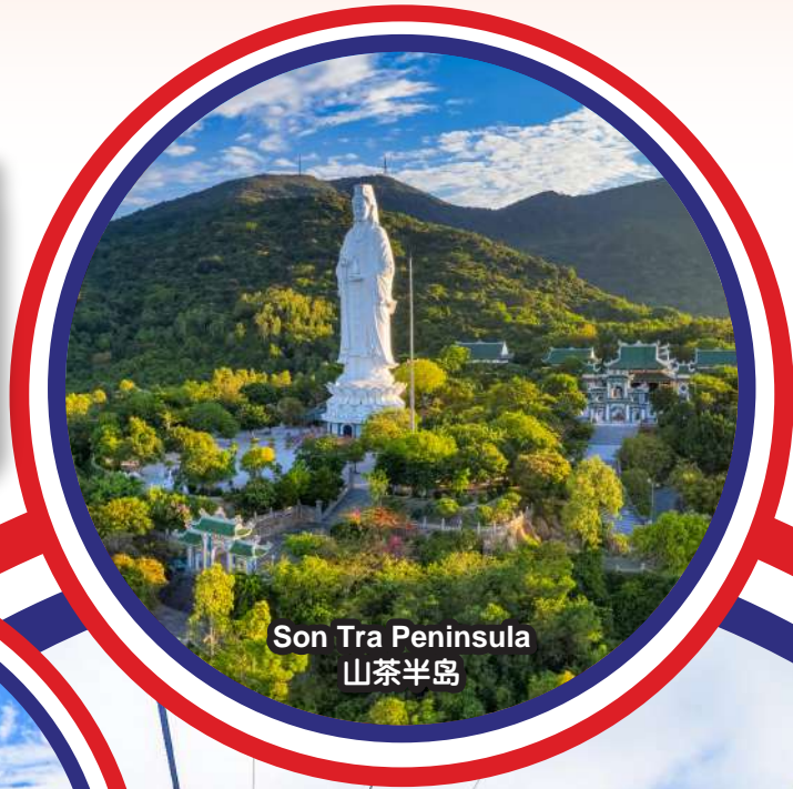
Son Tra Peninsula 山茶半岛