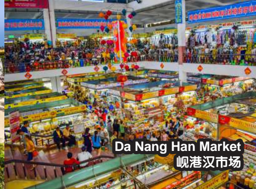
Da Nang Han Market 岷港汉市场