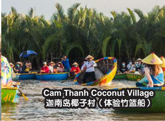
Cam Thanh Coconut Village 迦南岛椰子村 (体验竹篮船)