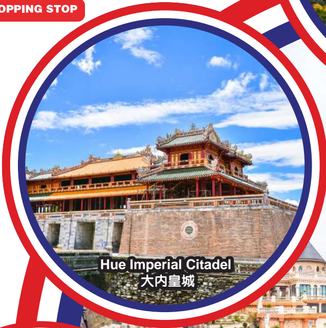
Hue Imperial Citadel 大内皇城