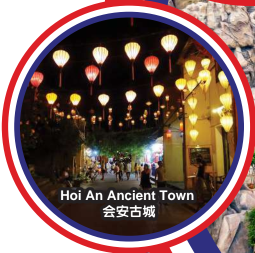
Hoi An Ancient Town 会安古城